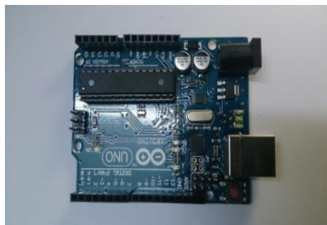
Figure 1. Arduino UNO R3

The Arduino projects provide an integrated development environment (IDE) supported process, and programming is completely employing a language supported wiring that is extremely almost like C++. The Arduino Uno is the motherboard for which this robot depends on utilizing the ATmega328. It has fourteen advanced pins for info and yield. It is fueled by a DC supply or an AC to DC gadget. Inside the Arduino, there is a microcontroller that is a PC circuit having a memory, processor, and programmable info yield pins as shown in figure 1.