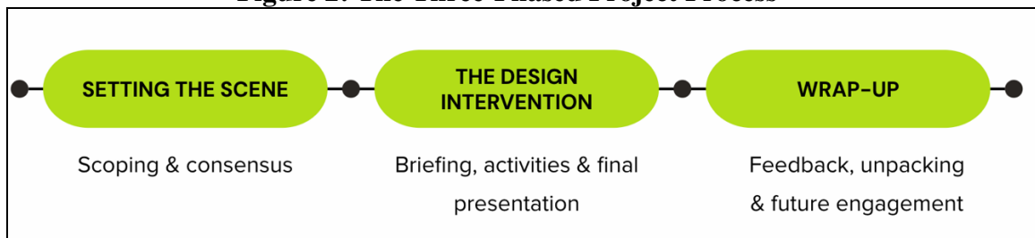
Figure 2: The Three-Phased Project Process

Specifically, the delivery of the client projects followed a three-phase process involving all stakeholders (Figure 2).