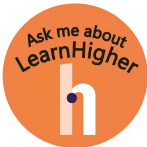
Figure 3. LearnHigher Badge.

For me, the idea of community is important. LearnHigher should represent the best of our resources – a peer-reviewed archive of materials that simply work. I fear that Learning Developers sometimes reinvent the same things over and over. We need an institutional memory, and where the Journal of Learning Development in Higher Education records our scholarship and research, it is LearnHigher that should preserve and propagate our learning materials.