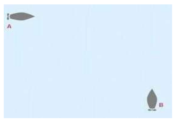
Figure 4.2 (Crossing Situation)<sup>524</sup>

Rule 18(a)(ii) in Section II where B would be the give-way vessel who must take action to avoid collision. There are, therefore, different possible interpretations that would require vessel B to take totally different actions under different Rules applicable to vessels in sight of one another. This leads to the conclusion that A cannot be considered to be 'in sight' of B. Thus, B cannot keep her course and speed and expect A to keep out of the way as a give-way vessel in a crossing situation.