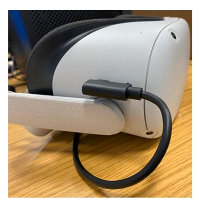
Fig. 1. The Meta Quest 2 headset is connected via a USB-C cable.

By default, adb is not enabled on the headset and can only be achieved by enabling both Developer Mode and USB debugging (Defence Science and Technology Laboratory, 2022). This was accomplished by upgrading the primary Meta (user) account associated with the device to a 'developer' account via the Meta Quest developer's website (Meta Developer, 2022). We then proceeded to download and install the Meta Quest app on an iPhone from the Apple App Store. Once the app was installed, we logged in using the new developer account. Bluetooth was enabled on the smartphone, and we paired the Meta Quest 2 headset to the app. Once paired, we enabled Developer Mode through the app Menu->Devices -> The Meta Quest 2 headset -> Headset Settings -> Developer Mode -> Toggle Developer Settings on as shown in Fig. 2. With Developer Mode enabled on the headset, we could access data through the developer account.