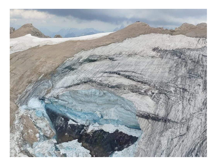
Figure 2. Picture of the Marmolada glacier and the area where a serac collapsed in July 2022.

The Dolomites territory extends across two regions, Trentino-Alto Adige and Veneto, and three provinces, Trento (TN), Bolzano (BZ) and Belluno (BL). Whereas Trentino-Alto Adige is an autonomous mountain region that includes the two autonomous provinces of Bolzano and Trento, in