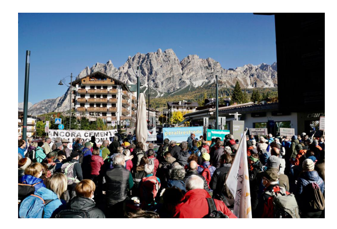
Figure 4. A socio-environmental protest organized by a network of associations in Cortina.

Therefore, the vision of the Olympics held by state and regional actors and shared by Cortina's mountain lift companies is intensely focused on attracting external capital flows, adopting the standards of international tourism and commodifying the mountains as widely as possible. Indeed, the significant bargaining power mountain lift companies enjoy in their relations with regional and national institutions has allowed them to earmark massive amounts of public funds to support private infrastructure and establish publicprivate partnerships for developing such facilities, not only in Cortina and around the Carosello Dolomitico project but also in Bolzano province. Especially in Bolzano, private lift companies have long-standing collaborations and powerful bargaining positions with the provincial government that have often enabled them to undermine environmental impact assessments on building new infrastructures and form partnerships to channel public funds towards their projects. Furthermore, the powerful position of such private actors has also undermined the operation of Fondazione Dolomiti UNESCO: it has recently failed to interrogate controversial projects located inside or near the natural heritage buffer area such as the Passo Giau resort and Catinaccio hut renovations. These projects, and especially the Carosello, have been legitimized by the insistence that they will contribute to sus-