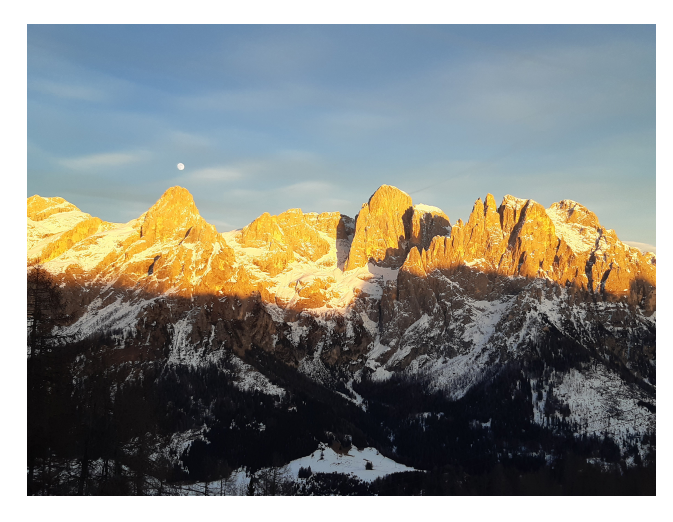
Figure 1. Photo of the Dolomites group "Pale di San Martino".

the summer 2022 heat wave and drought led to water scarcity issues, both at high altitudes and in valleys.