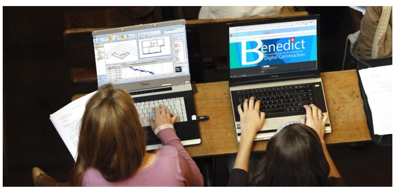
Figure 4: Students testing the BLE platform

The materials produced will be available on the open access web platform, which can be accessed at https://www.bim-enabled-learning.com/ble/course/. The platform is still in development and all BENEDICT project partners, will upload the materials produced in their home language and/or in English. Following are some preview images of the platform (figure 4, figure 5, figure 6, figure 7, figure 8). The BLE platform has a dashboard page where all the items are addressed: the courses and the data repository (figure 5). There three pilot courses addressing different topics of construction management, design management (figure 6), risk management (figure 7) and time management (figure 8). These three sections allow teachers and students to share open learning resources and learners' output.