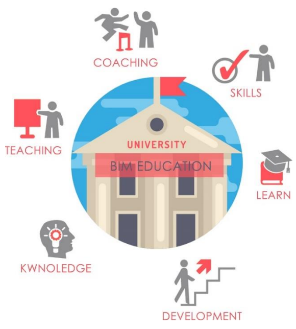
Figure 1: University and BIM Education

A key aspect, the main subject of the study under analysis, is that related to training future professionals within academia. BIM training programs, found in undergraduate courses in architecture and construction and civil engineering, play an important role in educational institutions (figure 1) (Shen et al., 2012), because they prepare a new generation of graduate professionals that are ready to work in the construction industry with a new ability to manage collaborative and interdisciplinary software.