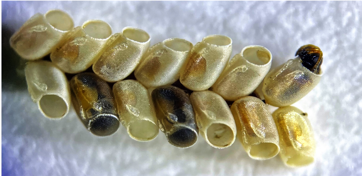
Figure 3. Paratelenomus saccharalis (Dodd) adult emerging from B. subaeneus egg and pharate adults in darkened eggs.

In the Neotropical region and in Panamá, to have parasitoids for potential use as biological control agents against pests like B. subaeneus is strategic, due to the socioeconomical importance of crops like Cajanus cajan . Ruberson et al. (2013) indicated Paratelenomus saccharalis as a specialist attacking eggs of the Plataspidae. We hypothesize the parasitoid entered Panama via port entry like Brachyplatys subaeneus .