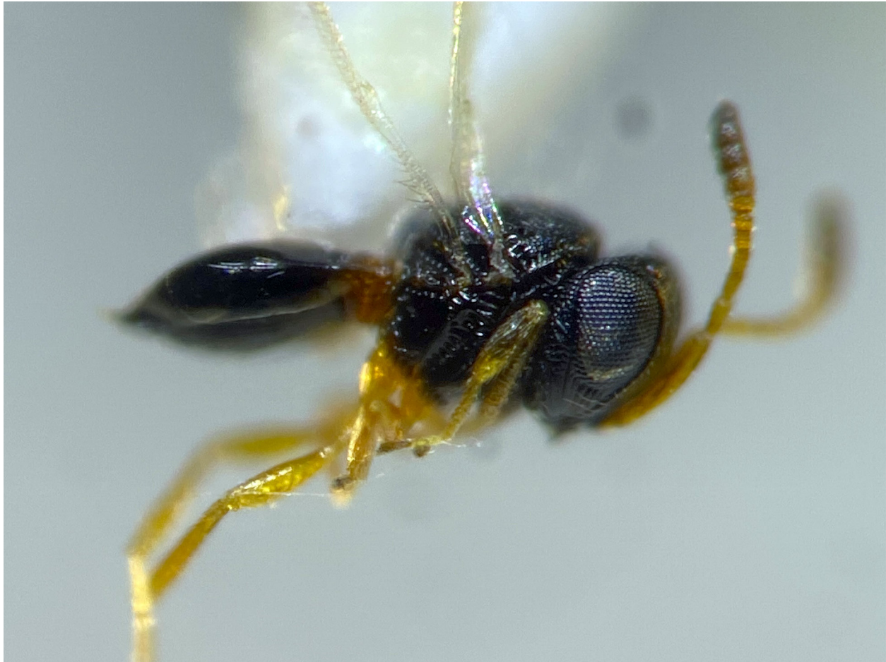
Figure 4. Paratelenomus saccharalis (Dodd): lateral view, female.