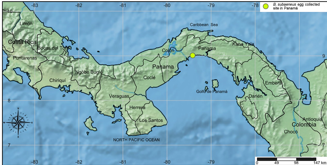
Figure 1. Collection site of Brachyplatys subaeneus (Westwood) eggs in Panama.

Distribution. Widely distributed throughout eastern Palaearctic (Ruberson et al. 2013), it was reported in the Holarctic-Neotropical region specifically in the southeastern USA by Gardner et al. (2013; Alabama, Georgia) and Medal et al. (2015; Florida). For Panama, this is a new country record and the first for the Neotropics.