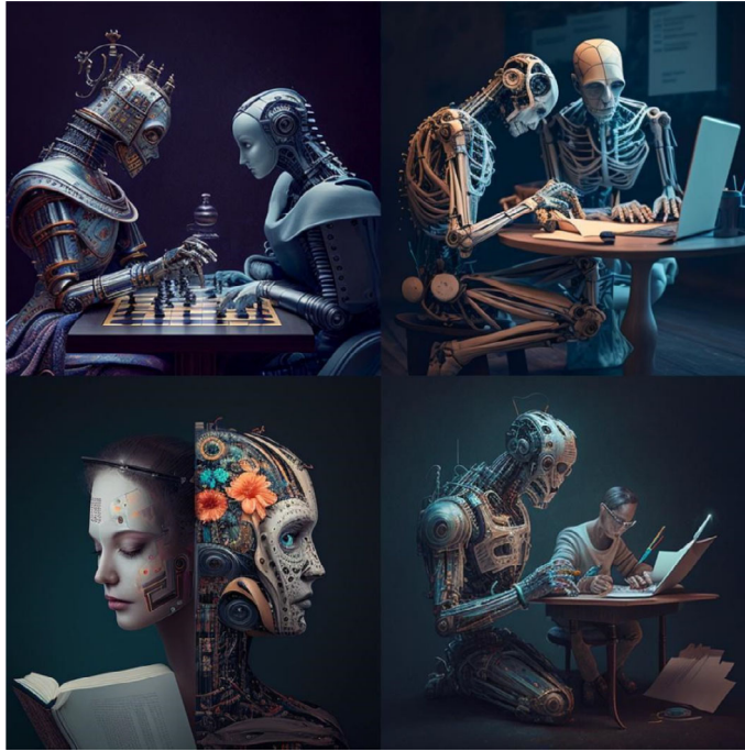
FIGURE 2. “Artificial Intelligence and Creativity collaborating” created with MidJourney software.