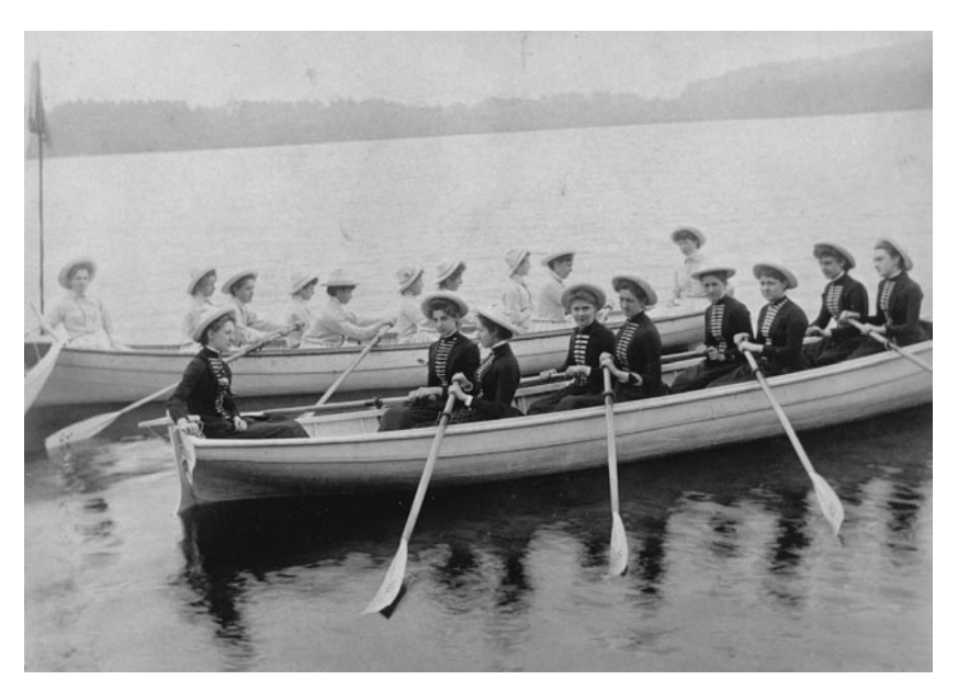
The Specials and Class of '87 crew. Note the corsetted basque bodices and the ensuing straight backs of the Class of '87, foreground, contrasting with the bloused tops and easier postures of the Specials behind them.