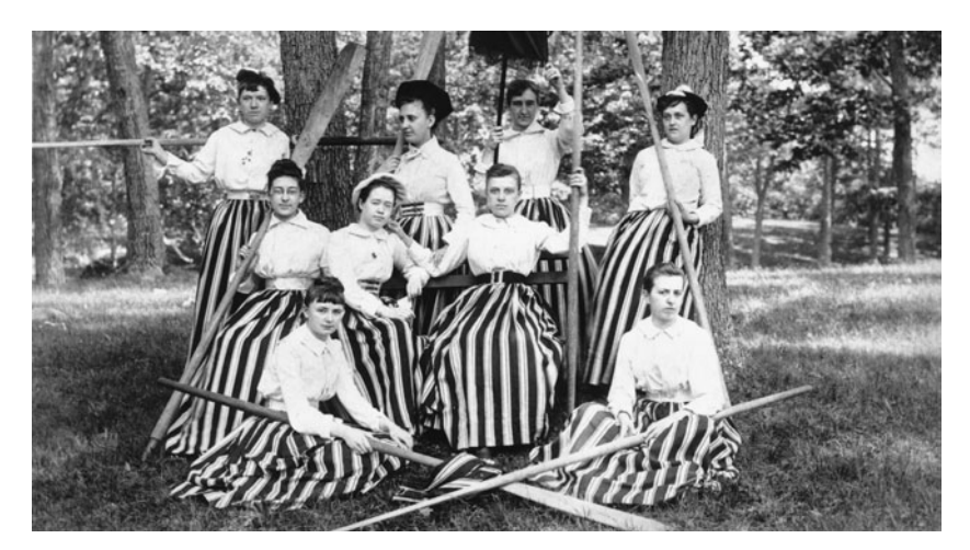
Freshman crew, wearing the popular stripes of the 1880s, 1889.