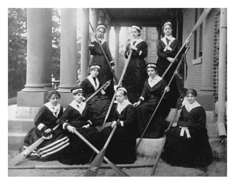
Crew of 1881. Hats, each with its identifying '81 on the band, and blouse shirts match, skirts do not.

impressive, less complete, and very likely less expensive than the upperclassmen's. They would consist of the same tops and hats, for example, but different skirts (depending on each girl's wardrobe), which barely showed below the gunwales of the boat when the wearer was seated to row.