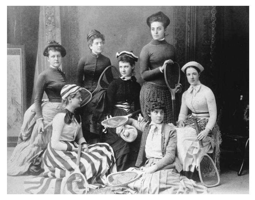
Wellesley College tennis players, Spring 1887. The two women center front wear loose bloused tops that contrast sharply with the tight basque bodices of the others. Note particularly the girl at the lower right: she forecasts the twentieth century—bare-headed, though clutching her tam, loose-sleeved, easy and relaxed—and the only one of the seven who does not wear a corset.

ley opened. It appeared at approximately the same time at Mount Holyoke, not for crew but for other outdoor activities. Clearly, it was an outfit for exercise, a gymnastic dress. It deserves mention here because it plays a twofold role. First, if it was a skirted dress with no trousers underneath, it sits somewhat precariously between the fashionable dress worn for sporting activities outdoors at the time and the truly athletic dress with trousers that women devised for gymnastic exercise indoors. Even though its loose top reflected Lewis's dictum, it really is neither one nor the other. Or it may have had trousers hidden underneath (see Cornelia Clapp's instructions for making a gymnastic suit in chapter 10). From this distance in time, we have no way of knowing for sure. Second, it provides the missing link that carries Lewis's unconfining baggy-topped dress into the twentieth century, to the new idea of sportswear. So the question is, why this dress, and why at Wellesley?