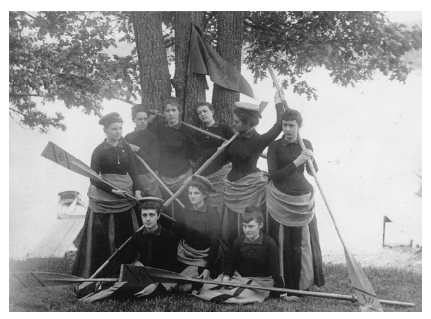
Class of '89 Senior crew succumbs to fashion.