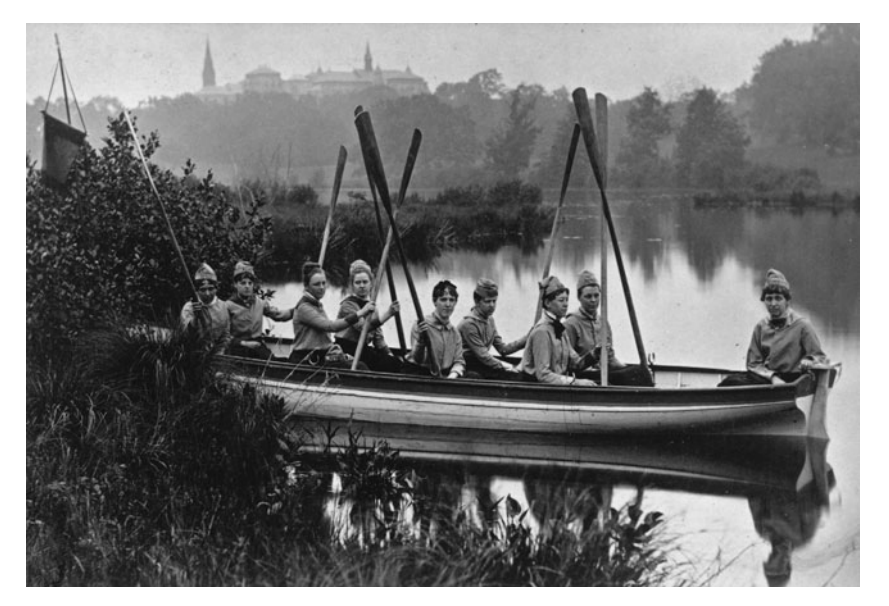
Crew of the Argo , 1879. Note the bloused shirts.

we see it here. The Delineator's winter catalogue (1888–89), in showing a ladies' yachting blouse, informs us that the style was "first published in June, 1883." In the catalogue for autumn (1889), four pattern illustrations for sports blouses appear: two sailor blouses, another nautical-style blouse, and a "tennis shirt." Two have the corsetted silhouette of high fashion, but the other two are the baggy, unfitted "blouse shirt," as The Delineator calls them. It is these "sport blouses" that form the basis of the outfits that I focus on in this chapter—the crew uniforms at Wellesley from the 1870s to 1892.