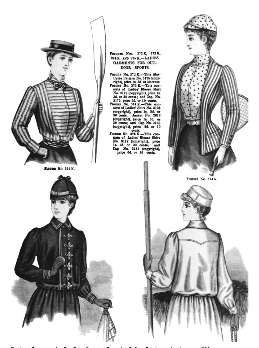
"Ladies' Garments for Out-Door Sports," Butterick & Co., Catalogue for Autumn, 1889.