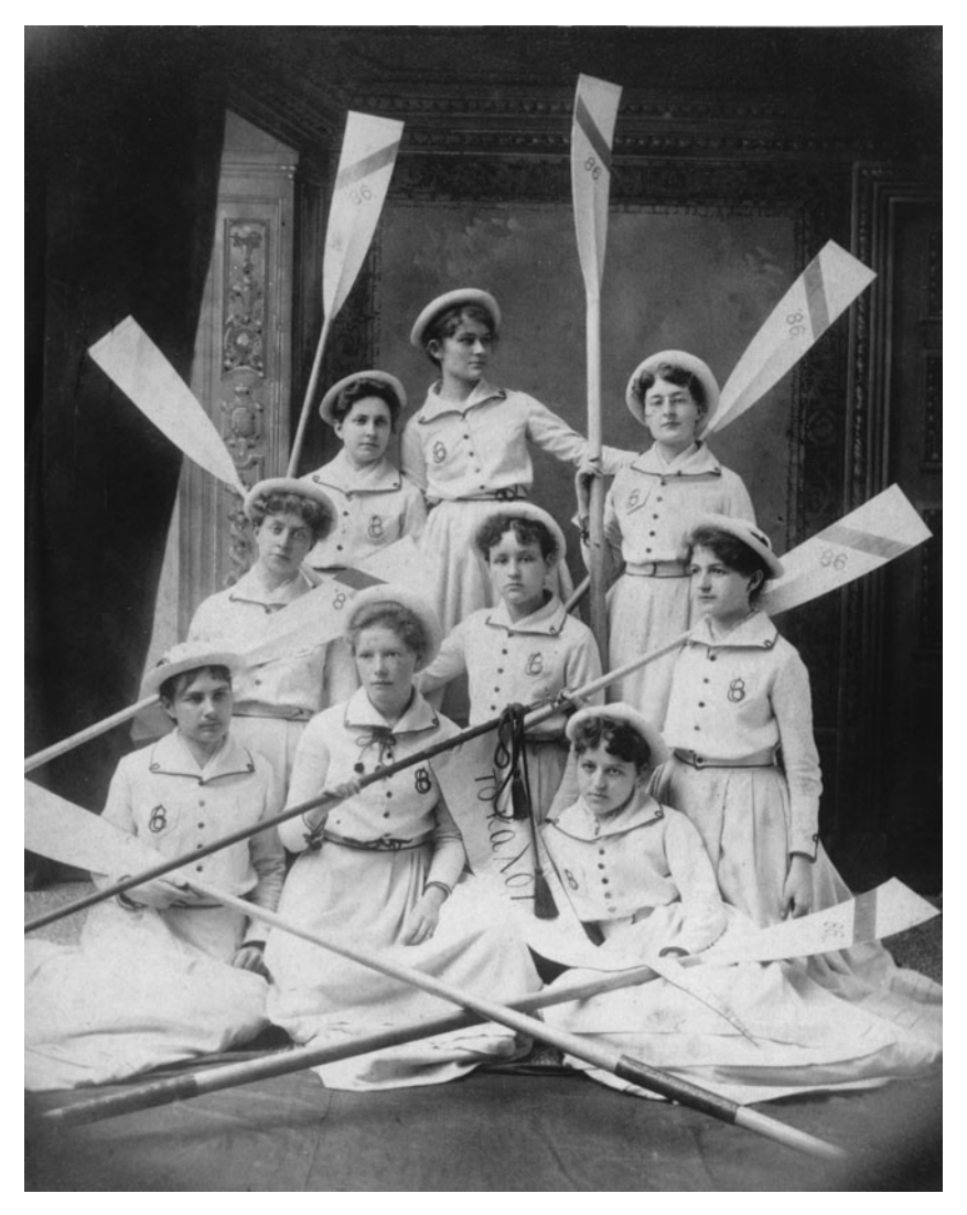
Class of '86 crew.

nology, "rolling collars"; the decoration depended on braid patterns and contrasting buttons, even, as in the class of '86 uniform, in the subtle positioning of the pockets. In the team photo, four members have pockets with a graphic "86" on the right breast and five have them on the left, a concession to the pairing of rowers on the boat's wide seats. The embroidered pocket would be on the side most visible to the spectators. It was the hats,