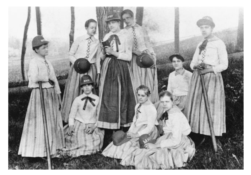
The Mount Holyoke Nines, about 1886. The uniform for baseball at Mount Holyoke echoes the crew blouse and skirt at Wellesley.

of the day. They represent the earliest continuous use of uniforms for a single sport worn by collegiate women in the United States. Mount Holyoke College students had formed a baseball team sometime around 1886 or 1887 (and, interestingly, wore a costume, complete with laced jersey sport top and striped skirt, very similar to the crew outfits at Wellesley in those same years). Other colleges also formed baseball teams for women at that time, quite likely also adopting a simple gathered skirt and loose top. As early as the 1860s, Vassar had designed its own gymnastic dress in gray with red trim, but it was used for exercise in the gymnasium only, not as a sport uniform.