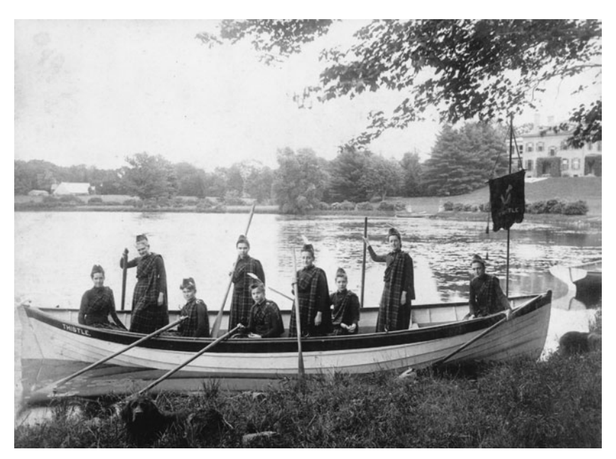
Miss Davidson's Freshman crew, resplendent in highland dress, 1889.