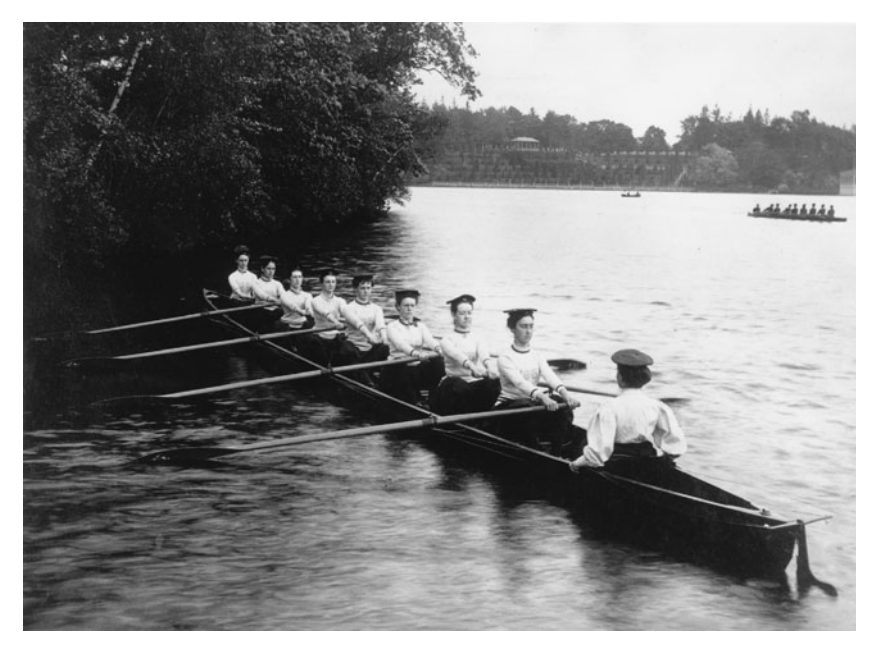
Class of '95 Freshman crew, 1892. Not only the new boats were streamlined, so were the uniforms by 1892.

dered with the name of the boat, Narcissus." All three freshman crews went hatless, another first. Miss Hill "was heard to say that 'they were the best freshman crew that had ever appeared on the lake.'"<sup>25</sup> In 1898 the clothing was not even mentioned in the newspaper accounts, and by the turn of the century, all the teams were wearing the regulation gym trousers and turtleneck or laced-front sweater.