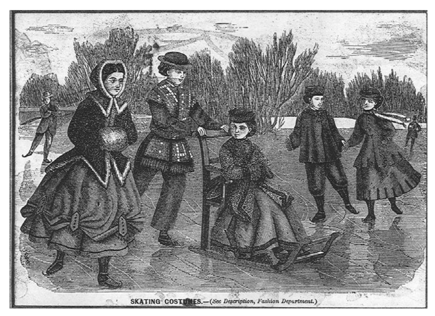
"Skating Costumes," 1869. Boys and girls enjoy the ice together. The one non-skater, perhaps a pre-learner, is pushed in a chair with runners. All are fashionably dressed, the girls in "short" skirts, modified to prevent tripping on their skates.

Another difficulty he encountered was that of finding "a sufficiently private place for learning." Here we discover the circumstances under which a young woman might participate in any new sporting activity, not just skating. We shall see these conditions reiterated again and again over the years, whether with swimming and bathing, bicycling, or any other sport. The author insists that women must learn away from the eyes of strangers, and if under the tutelage of a man, it must be a brother or close friend: "It is, for obvious reasons, very desirable that a lady's first day on the ice should be only in the company of some few friends upon a pond not frequented by others. . . . A brother or a friend, used to the ice" might accompany her. "Another reason why skating is not general among women," he asserts. "is a natural objection each one feels towards taking the first step. That is, the first step among her own circle of friends. A few, a very few, ladies do skate, and have done so now for many years." His exhortation concludes, "It is a great folly, to say nothing of the positive wrong, to narrow the straitened limit of out-door amusements in which ladies are privileged to indulge."