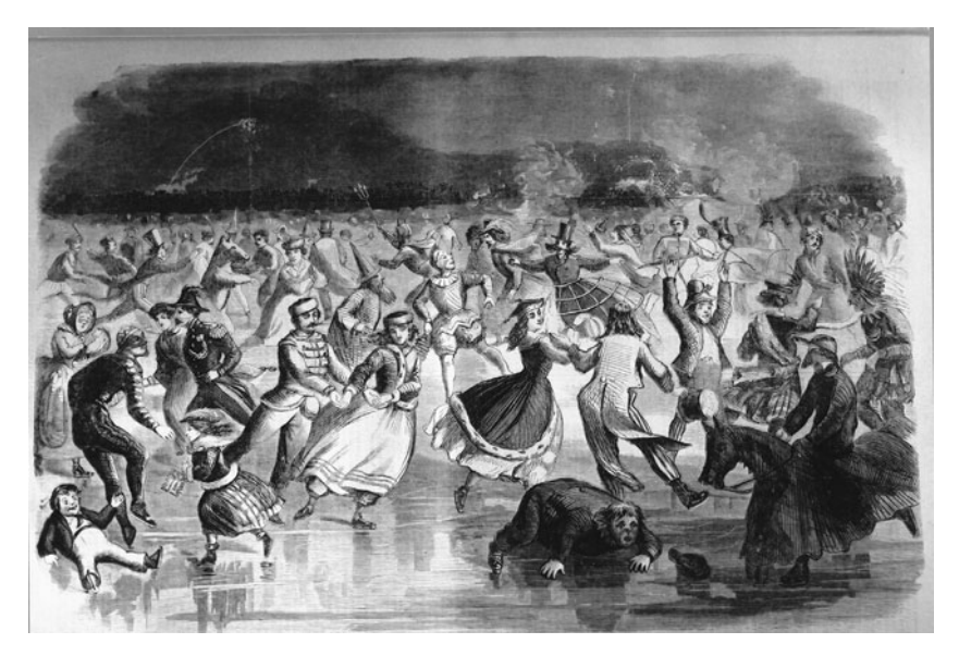
"Skating Carnival in Brooklyn, February 10, 1862." Note the woman of the central couple wearing bloomers under her skirt. Of all the people on the ice, she alone wears the "costume." Harper's Weekly , February 22, 1862, 125.

month, answers just the same purpose. The only advantage of the regular costume is, that there is less weight to carry, and it is certainly more effective. A long skirt is, of course, worn over a skating dress in going to and from the place of rendezvous.<sup>35</sup>