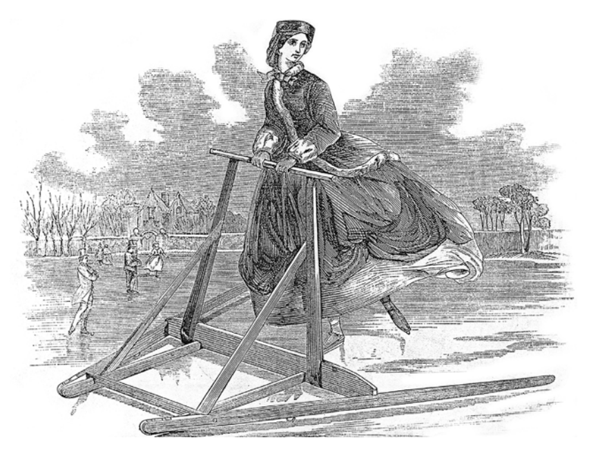
"Safety Skating Frame, for Beginners." Note the hoop shaping the shortened elevated overskirt. Despite the voluminous layering, the lower body seems to be vulnerable to winter's chill. Godey's Lady's Book , December 1863, 505.

"matter of curiosity to know how the Empress contrives always to appear with such well-setting skirts." Her "well-starched flounces," the writer sniffed, were "a costly contrivance, and. . .not suitable for those who take much walking exercise." Or skating exercise either, it would appear, in spite of her alleged fondness for the Suresne.