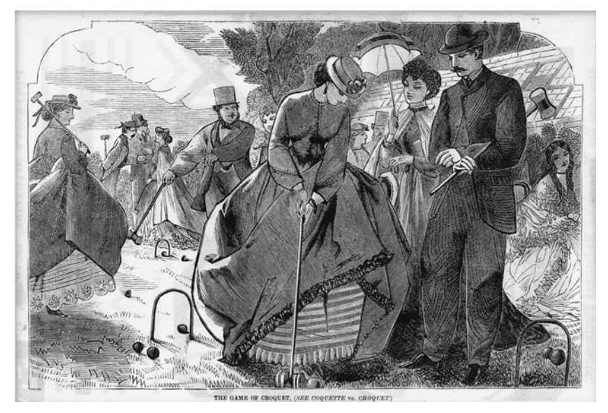
"The Game of Croquet," about 1867. The social setting, party atmosphere, elegant dresses with hiked skirts that display decorative petticoats, and concentration on the game are evident. Collection of the author.

physical activity in the company of men. Because of this, croquet parties were incorporated into other social activities that women organized during the summer season—weekend parties, lavish champagne suppers, dinner parties, and dances. A colored fashion plate from Peterson's Magazine in July 1870 portrays "a lawn party, with croquet players, etc., etc. These parties are going to be very fashionable, this summer, in the country," declares the commentary. "They are given in the daytime, and out-of-doors, though, sometimes, they finish with a dance, in-doors, after sunset." <sup>10</sup>