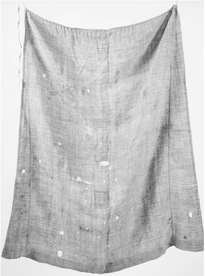
Checked apron, 1800–1840. Courtesy of the Pocumtuck Valley Memorial Association, Memorial Hall Museum, Deerfield, Mass.