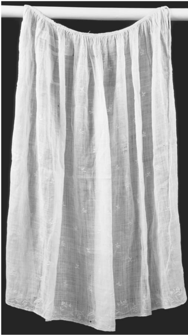
White apron, 1780–1800.

White aprons were intended to be decorative rather than functional in the eighteenth century. Earlier in the eighteenth century aprons were vehicles on which women could display their skills in embroidery, stitching colorful floral patterns across silk backgrounds; later in the century, however, preference shifted to linen aprons embroidered with white linen threads. White aprons remained in fashion until the turn of the nineteenth century, when the empire style eliminated the natural waistline, making the apron an awkward accessory. Their decline in fashionability may also reflect changing attitudes toward women's housework in this period, as middle-class white women were increasingly inclined to demonstrate their refinement rather than their industry.