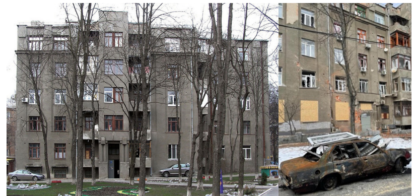
Figure 1: Slovo House in 2021 (left) and after shelling in March 2022 (right) 2

On March 8th, 2022 a series of Russian artillery bombardments over the Kharkiv Region in Ukraine damaged a monument of local significance, Budynok Slovo ('Slovo House'), located at #9 Culture St., in the central city of Kharkiv. 1