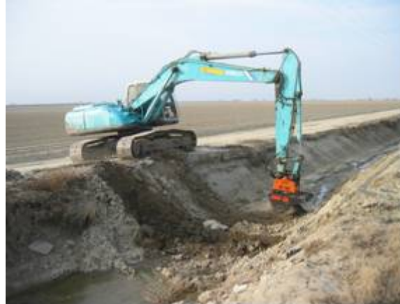
Figure 6. Compacting the sides and bottom of Lateral H at James ID