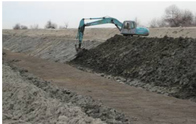
Figure 3. James ID Main Canal during side compaction