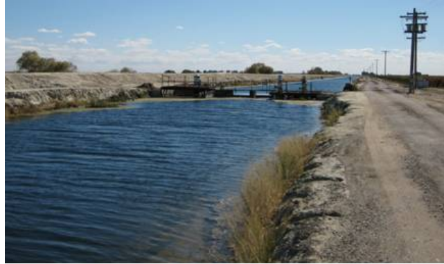
Figure 2. James ID Main Canal during pre-compaction seepage test.