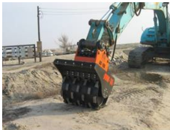
Figure 5. MBW 36” vibratory roller attached to the end of an excavator arm.

The compaction accessories cost about $25,000 (not including the cost of the excavator) installed. An experienced operator was able to compact the sides of 1 mile of canal (both sides, meaning 2 miles total) in about 8 days. The cost for the operator, transport of the excavator, and the excavator rental was about $1.20/foot of canal, with about 10 feet of compaction on each side of the canal (cost = $1200 for 1000' long pool).