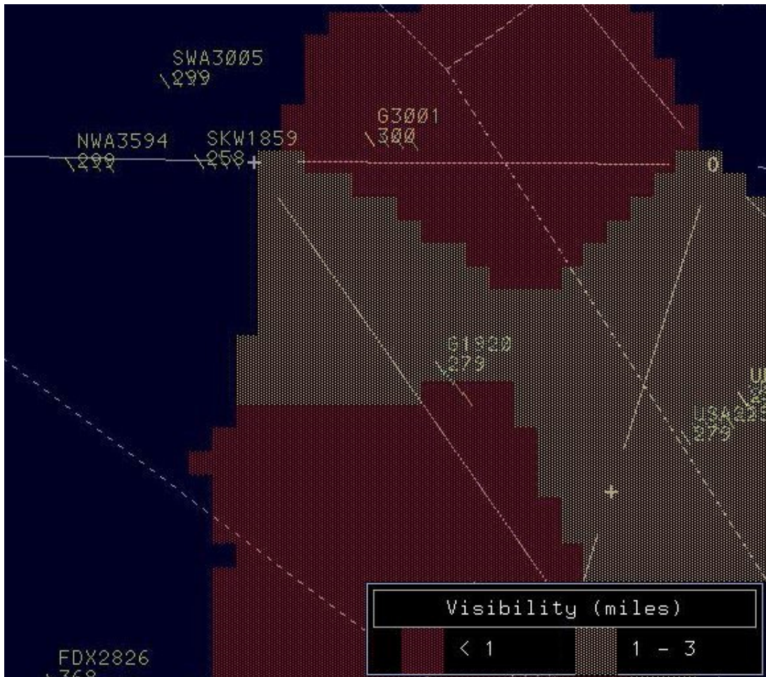
Figure 3. Visibility Display.

The Visibility Display in Figure 3 shows an example of shaded regions for two visibility levels that are below VFR minima (i.e., no-go regions). The first region shows areas that have a visibility of less than 1 mile, and the second region shows areas that have a visibility between 1 mile and 3 miles. Non-shaded areas on the situation display have a visibility of more than 3 miles, which meets the visibility minima for VFR operations (i.e., go regions). Alternatively, the Visibility Display can be tailored to display all visibility conditions (in miles) across the sector. The Visibility Display has the same spatial resolution (5 kilometers) and update rate (every 5 minutes) as the Ceiling Display.