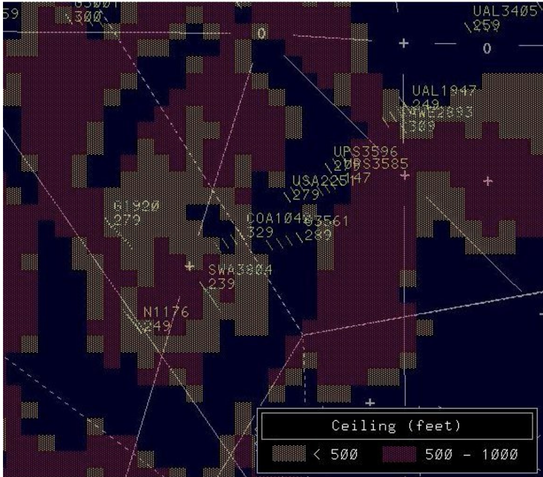
Figure 2. Ceiling Display.

The graphical Ceiling Display in Figure 2 shows an example of two different shaded areas for ceilings that are below VFR minima (i.e., no-go regions). The first area shows ceilings below 500 feet, and the second area shows ceilings between 500-1,000 feet. Non-shaded areas on the situation display have a ceiling of more than 1,000 feet, which meets the ceiling minima for VFR operations (i.e., go regions). Alternatively, the Ceiling Display can be tailored to display all ceiling levels (in feet above the ground level) across the sector. The grid resolution for the ceiling data is 5 kilometers, and the display updates every 5 minutes.