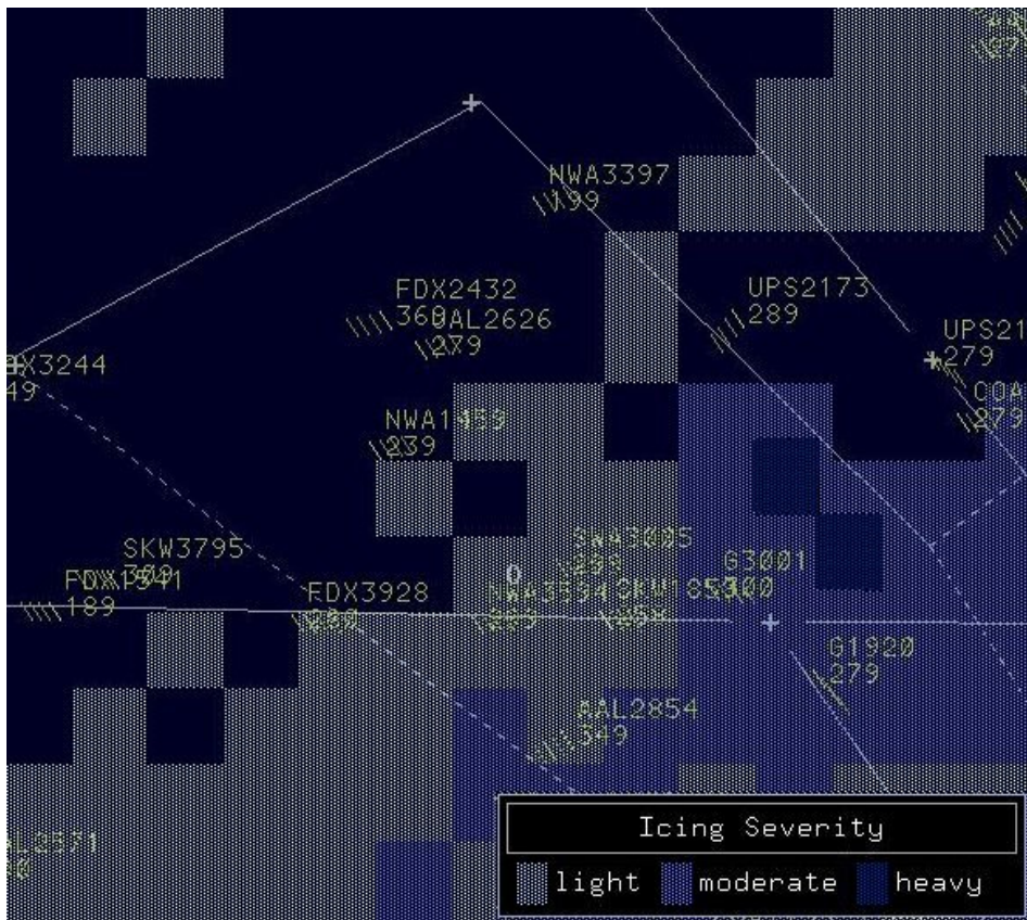
Figure 6. Icing Severity Display.

The Icing Severity Display in Figure 6 depicts shaded areas for expected light, moderate, and heavy icing. The controller can select and display the icing severity for one of eight different pre-defined altitudes. As for the Icing Probability Display, the specific altitude strata are determined by the ARTCC's geographical region, weather patterns, traffic patterns, and are not likely to be the same across ARTCCs in the CONUS. The grid resolution for the Icing Severity Display is 20 x 20 kilometers with an hourly update rate.