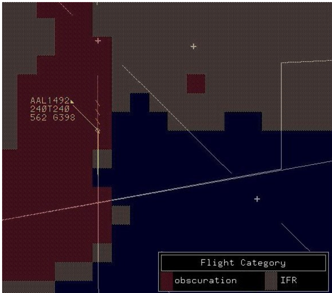
Figure 4. Flight Category Display.

The Flight Category Display example in Figure 4 is derived from the Ceiling and Visibility Displays. The display shows shaded regions for obscurations and IFR conditions. Both of these regions are no-go areas for VFR aircraft. All non-shaded regions on the situation display represent VFR conditions. The spatial resolution and update rate is the same as for the Visibility and Ceiling Displays.