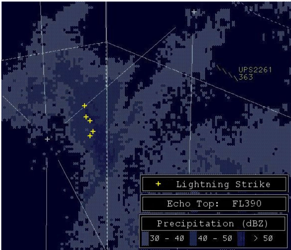
Figure 1. Precipitation Display.

For the Precipitation Display, we use NEXRAD data corresponding to moderate (30-40 dBZ), heavy (40-50 dBZ), and extreme (50+ dBZ) precipitation intensities (see Figure 1). The grid resolution of the precipitation information is 1 kilometers. The display allows the controller to select a specific altitude stratum that exactly corresponds to the vertical sector limits. This prevents the display of precipitation intensities that are outside of the controller's area of jurisdiction. The display allows the controller to independently select any combination of the three precipitation intensities.