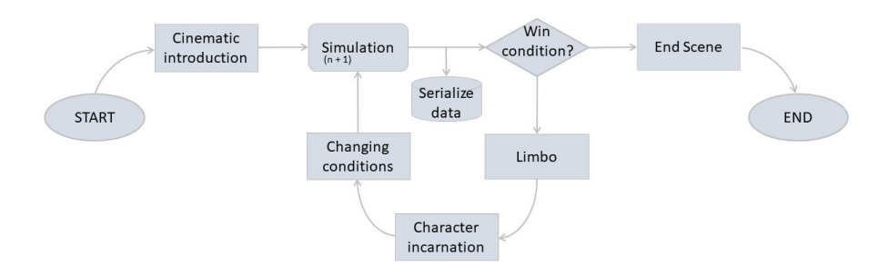
Fig. 2. Quantum Leaper game flow.

The main game concept is inspired by the NBC science-fiction television series Quantum leap (1989-1993). Thus, the player is an archaeologist from the future involved in an experimental technique that allows consciousness to timetravel. An accident happens and the player's consciousness travels to the past, involuntarily replacing the consciousness of a person that lived in the Ancestral Puebloan culture, formally called Anasazi, in the Long House Valley (Arizona, USA) between 800 and 1350 AD. When this happens, the course of history changes. In order to come back to the present (i.e. finish the game), the player has the task to match the games' course to the historical development (increasing a convergence score). This can be done by incarnating in individuals, immersing into their biographies, and influencing the behaviour of immediate peers through dialogue and social interaction. This combination of context and mechanics was considered the best solution for making the agent-level perspective compatible with immersive gameplay, given the centuries-long scale of simulations. The game flow is represented in Fig. 2.