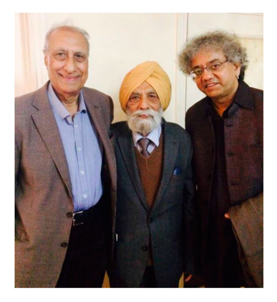
Figure 4. Aulia and Kanwal with Aulia's brother-in-law and son of Ustad Alla Rakha, the percussionist and djembe player Ustad Taufiq Qureshi, at the Namdhari gurudwara in East London, on 5 August 2017.