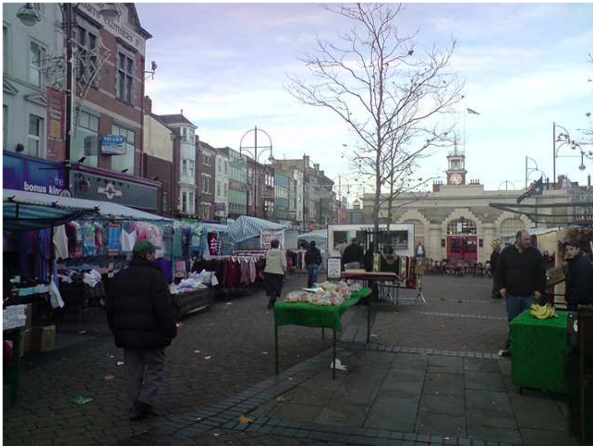
High Street, Stockton