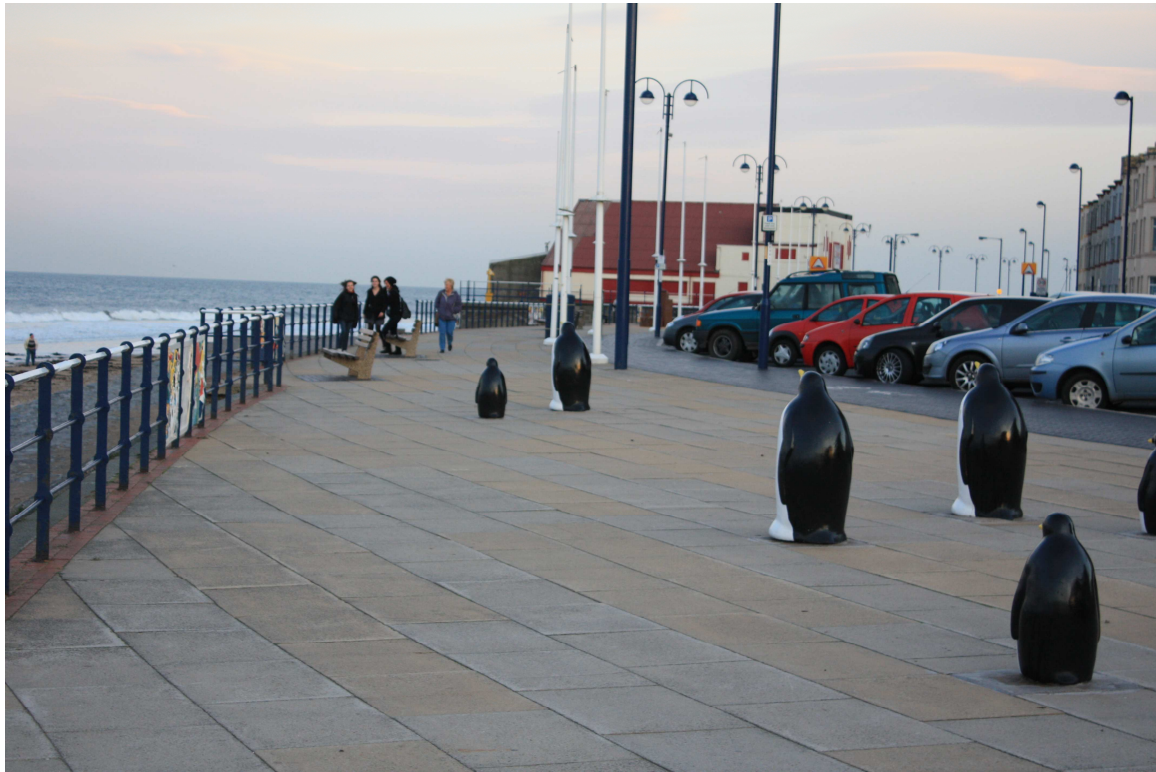
The Esplanade, Redcar