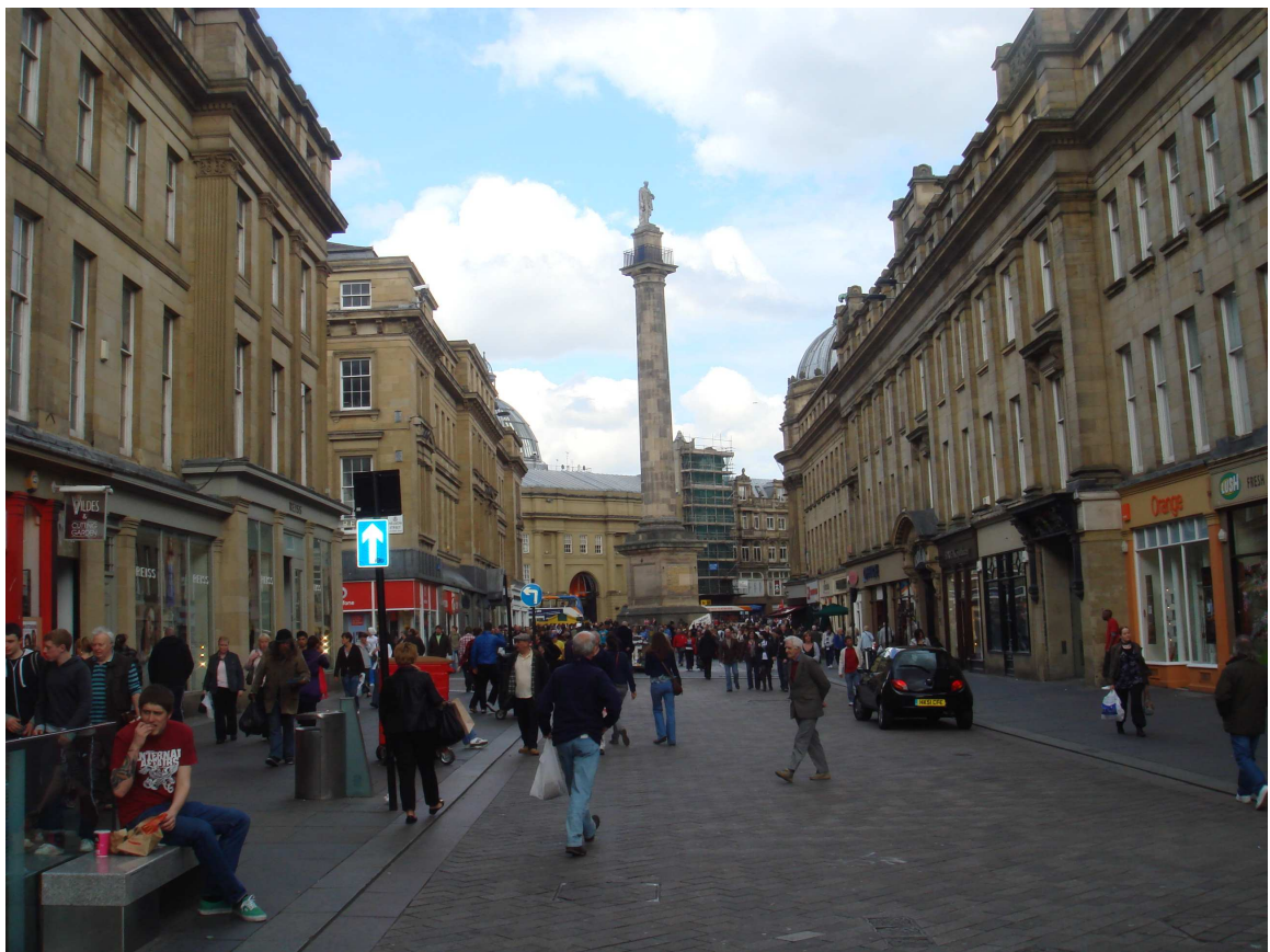
Old Eldon Square and Grey's Monument, Newcastle