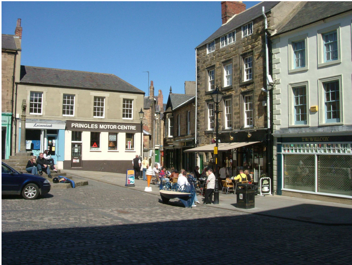
Market Place, Alwick