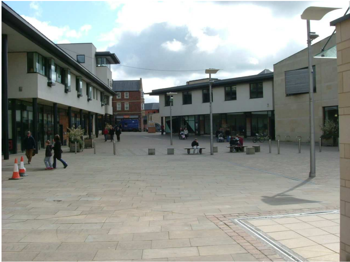
Millennium Place, Durham