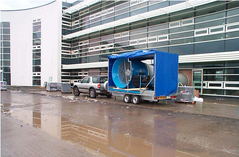
Figure 1. Air Leakage Testing at Riverside House, January 2003.

With the requirement set, the Design Team held a workshop with Tolent on site to agree a strategy for detailing, construction and testing. Tolent took the sensible step of undertaking an air leakage pre-test when the building was substantially airtight, although it was known that there was still an amount of sealing to complete. Air Tightness Services from Leeds completed this pre-test in October 2002 and it demonstrated an air permeability of 14.6\text{m}^3/\text{h}/\text{m}^2 at 50Pa. Testing with smoke pencils clearly indicated the leakage paths to Tolent and this information was fed through to the site team for remedial action where required.