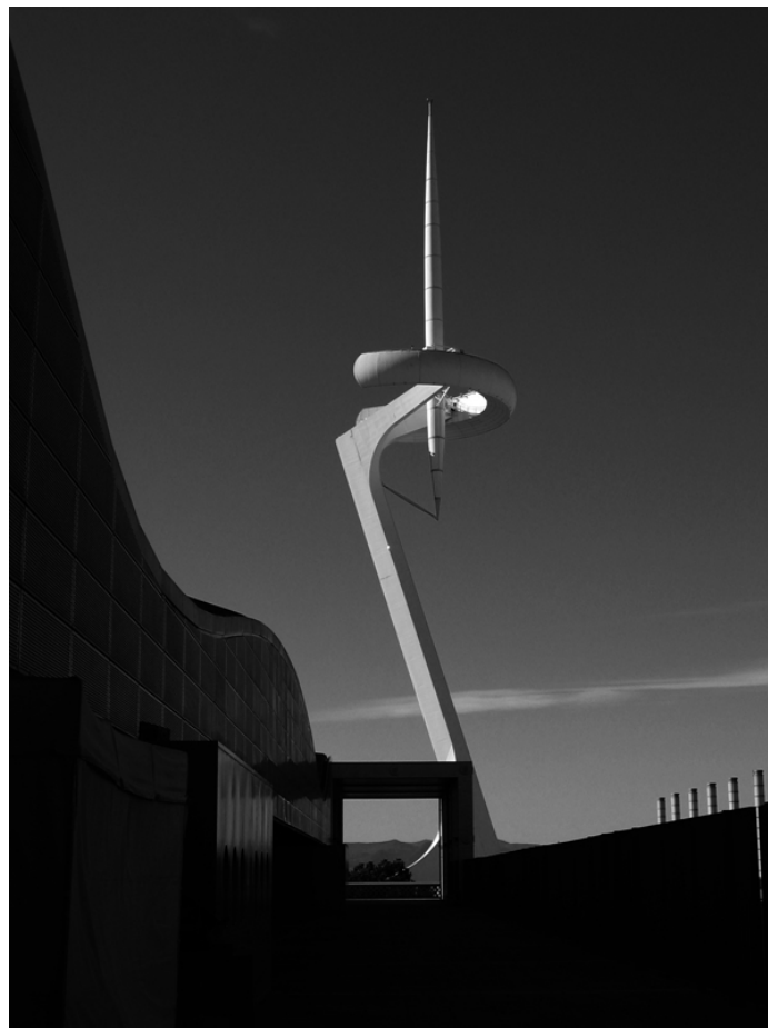
Fig. 8 The Communication Tower, Barcelona 1992

Despite the number and calibre of the invited international designers (A. Isozaki, V. Gregotti, N. Foster) the Barcelona Games were intrinsically Catalan; not only for the idea expressed above, i.e. to 'use' the Olympiads for the benefit of the City (and not the other way around) but also for the presence of a building that became the symbol of Barcelona 1992. The Communication tower in the Olympic Area of Montjuïc, by Santiago Calatrava, linked perfectly the contemporary Architecture of Barcelona to some of the most important figurative research expressed in the past in the same city, from Gaudí to Dalí. In this respect a result very similar to that which was achieved in the other Games treated in this article, Rome, Tokyo and Munich.