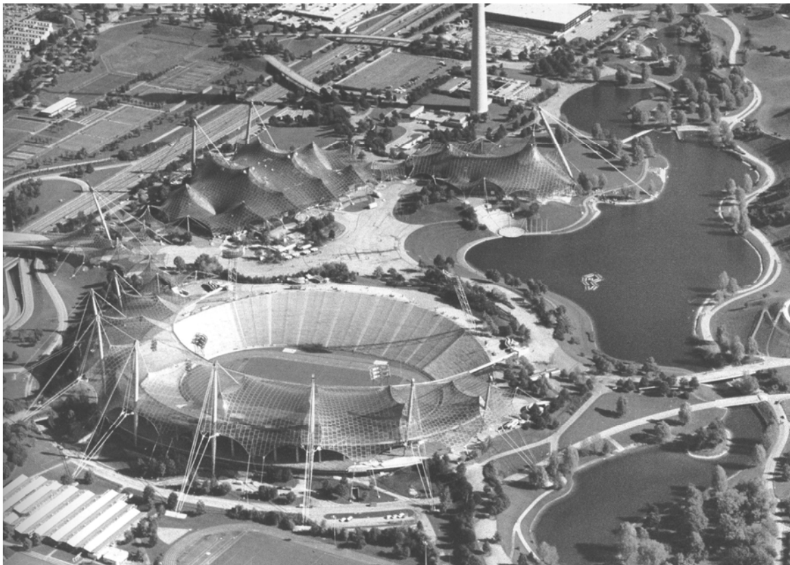
Fig. 7 The Olympic Area, Munich 1972

The Design team for the Olympic village area (which included the Swimming pool and Stadium) was based in Stuttgart with Gunther Benisch as the main architect and Jorg Schlaich as a young structural designer. The outcome of their work was, again, a perfect example of integration between Architecture and Engineering and also the expression of the particular design culture of the host country. Here, however, the reference was not formal as in Rome and Tokyo but rather 'structural'. Also, differently from the previous case studies and probably due to a precise political decision, the principle behind this project was not the attempt to link the present with the past but to proudly show the height of research achieved in Germany or, in other words, to link the present with the future: a challenge which was embraced again, and pushed forward twenty years later in Barcelona.