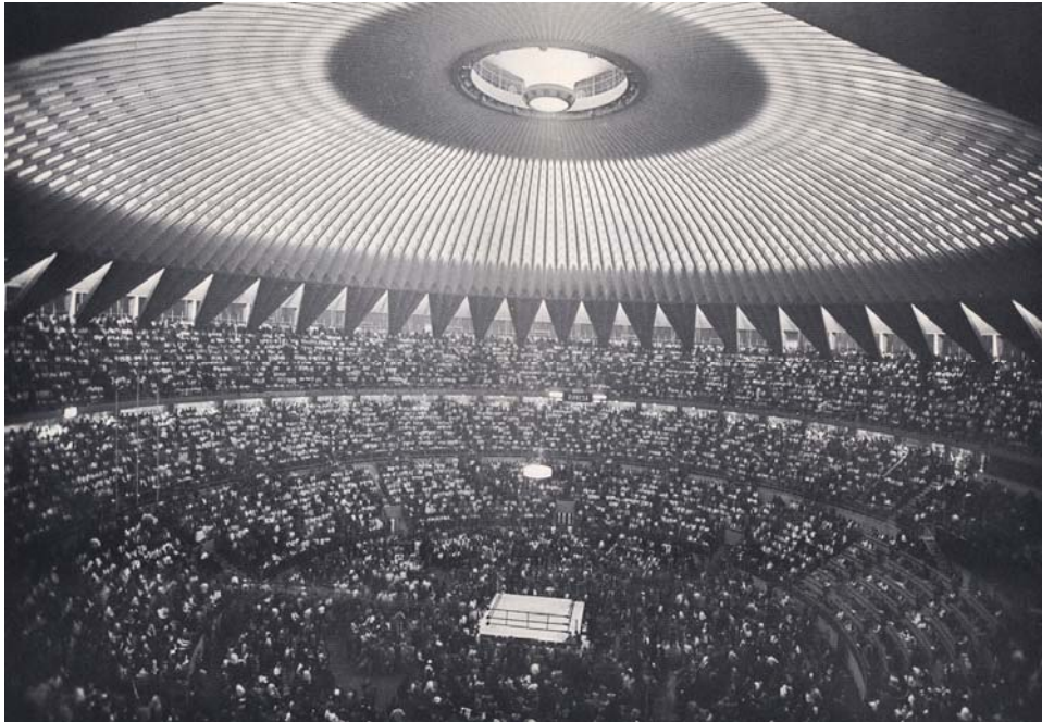
Fig 4. The Palaeur, Rome 1960

All the above considerations lead us to the conclusion that Nervi, in designing the two buildings which became the icons of Rome 1960, managed to link these modern structures to the complex context of a historical city like Rome. The results were excellent, the domes proved to be at the same time functional and evocative, a perfect balance between Structure and Architecture, exactly as their ancient predecessor.