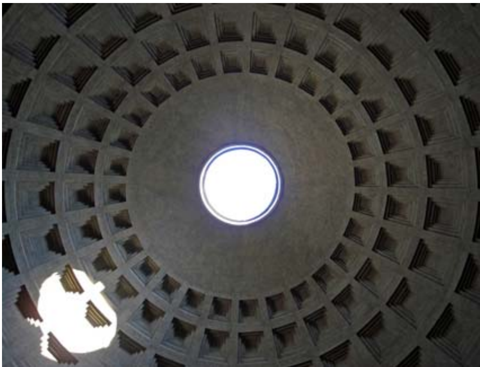
Fig. 5 The Pantheon, Rome 125

All the above considerations lead us to the conclusion that Nervi, in designing the two buildings which became the icons of Rome 1960, managed to link these modern structures to the complex context of a historical city like Rome. The results were excellent, the domes proved to be at the same time functional and evocative, a perfect balance between Structure and Architecture, exactly as their ancient predecessor.