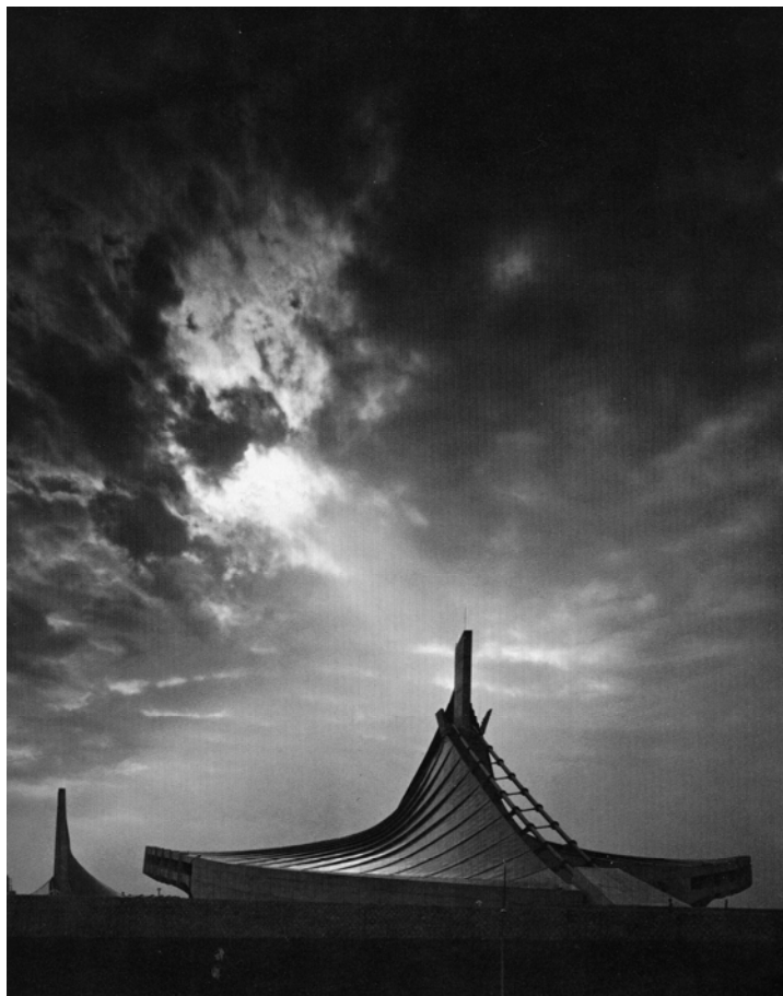
Fig. 6 The Olympic buildings, Tokyo 1964

However, again similar to Nervi's arenas in Rome, the roofing solutions are the most interesting aspects of the two sports halls. In the larger building, the swimming pool, the evocation of a traditional temple roof by the architect is counterbalanced by the revolutionary tensile structure of the covering conceived by the engineers. This technology had been known and used since the late 1950s (le Corbusier, Saarinen) but it was for the first time here that Prof. Tsuboi and his young colleague, Kawaguchi managed to apply it on a huge scale, indeed, in 1964 the tensile structure used in the swimming pool was the largest in the world. As it will be shown later in this article, similar suspension roof technology was used in 1972, by Frei Otto to design the covering of the Olympic Stadium in Munich (1972).