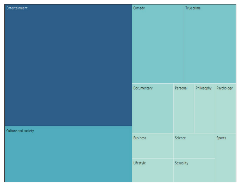
Figure 2. Topics of European podcasts with an active fandom