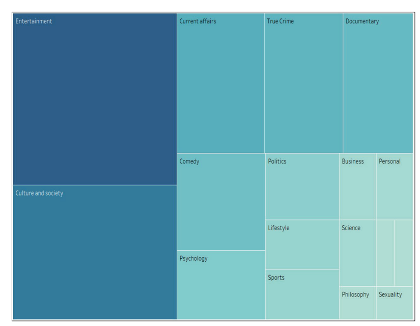
Figure 1. Topics of the most popular podcasts in Europe

As per "where" the main European podcast fandoms are, the majority of these communities are active on both Twit ter and Instagram but there is a preference shown towards Instagram for fandom-created content. Fandoms use exclusively Instagram 60% of the time,