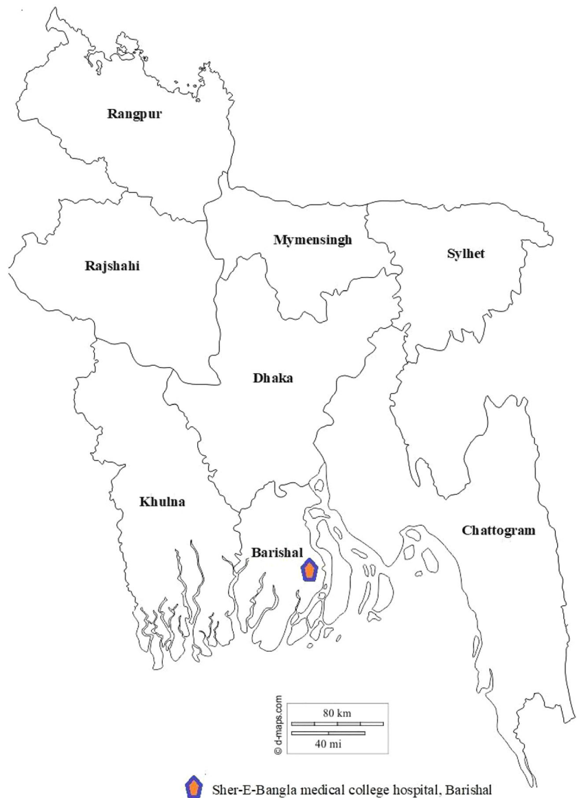
Fig. 1 Location of study hospital in Bangladesh map