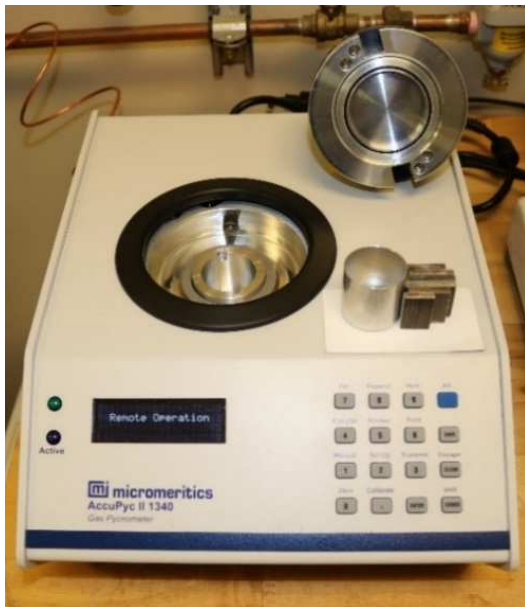
Figure 1: ACCUPYC® II Helium Gas Pycnometer

Water is the most commonly used liquid with this method. Due to the hydrophilic nature of natural fibers, immersing their composites in water may cause absorption of water by the fibers, thus affecting the value of measured density. In some studies water has been used to measure the density of natural fiber composites [21, 22]. In this method, the weight of the samples in the water started to increase without stabilizing. This is an evidence of absorbing water (rather than the removal of bubbles that stops in a short period of time) which was validated after testing by reweighing the samples. To avoid this problem, before immersing the samples, they were rapidly wetted to remove the air bubbles surrounding the sample and they were weighted in the water in a short time after immersion to avoid absorption. In this study, the validity of using water as immersing liquid for measuring FFRP composites will be investigated by comparing the three measuring methods.