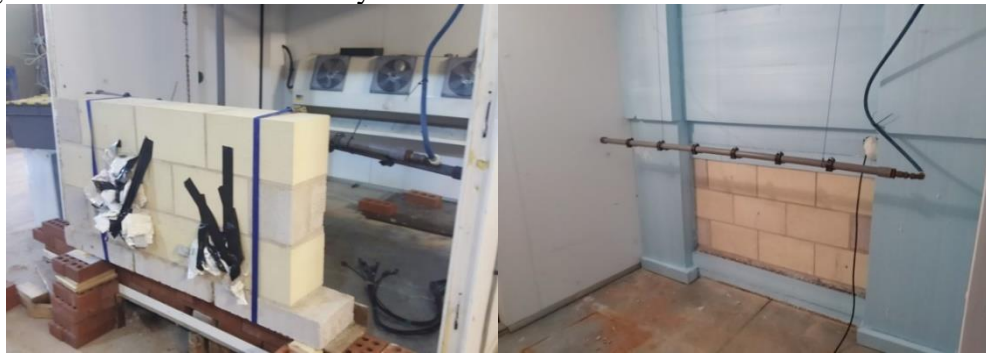
Figure 1. Test wall installed into climate chamber for frost testing. 1a. Exterior, prior to installation. 1b. Interior, after sealing.

surrounding chamber using polystyrene sheeting and were sealed to prevent water ingress from above or around the sides of the panels (Figure 1). Chamber conditions were verified by test run with the wall in situ to confirm thermal performance. Testing commenced as soon as chamber conditions were confirmed. A study of data from the Meteorological Office suggested that a moderate frost cycle should be utilised. Chamber temperatures were initially set at -4 but the frost front did not penetrate deeply enough into the stone to initiate damage (Laycock, 1997). It was therefore incrementally lowered when the panel was in situ in order to ensure that the frost front passed through the block to a depth of 30mm and released during the thaw cycle. This regime was found in previous work on the Magnesian Limestone to cause damage. This resulted in a final cycle between +8 to -10°C, cooling and warming at 0.45°C/min, 2 minutes of simulated rain and 10 cycles per day. The chamber was maintained at -10°C for 14 minutes. A total of 300 freeze/thaw cycles were carried out. Phase 2 repeated this regime with 9 blocks of Cadeby stone cut to the same sizes as before.