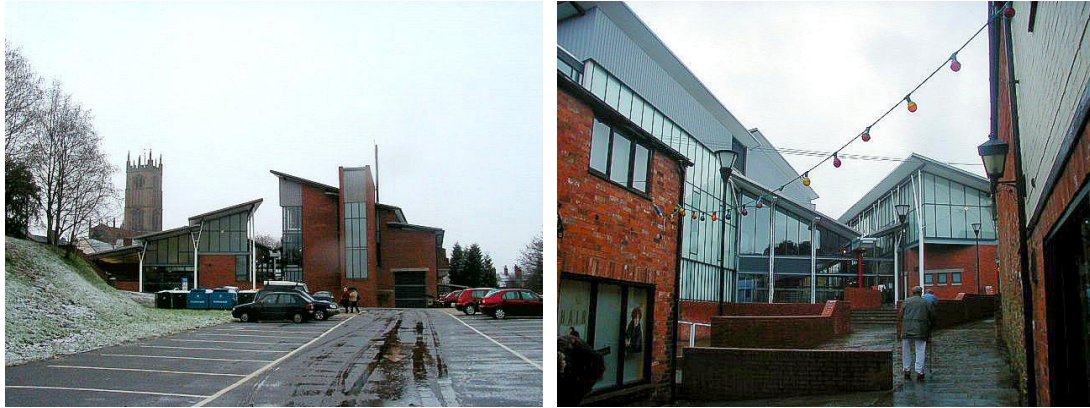
Dorchester – Calliford Rd N, residential (suburban part of Conservation Area)