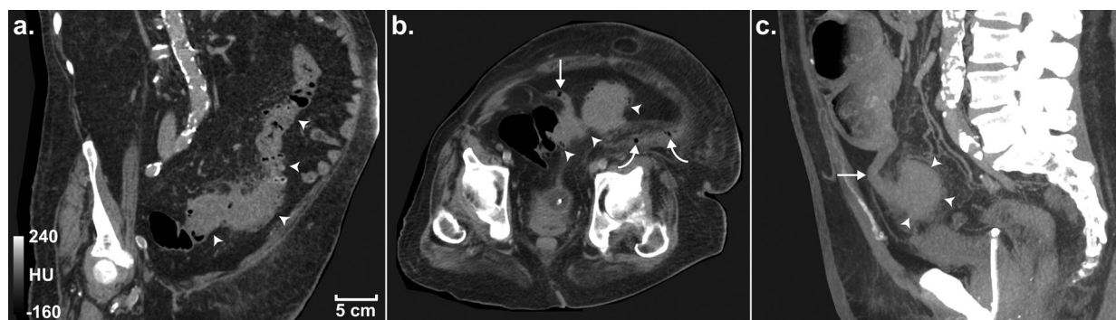
Fig. 1 – Admission CT images showing sigmoid diverticulitis, appendicitis and locules of free gas in the left retroperitoneum. (A) 1.25 mm thick coronal oblique slice demonstrating a long segment of thickened sigmoid and descending colon (arrowheads) with multiple inflamed diverticula; (B) 1.25 mm thick axial slice demonstrating the inflamed appendix (arrow) adherent to the inflamed sigmoid (arrowheads) and locules of gas within the retroperitoneal space (curved arrows) and (C) a sagittal, 30 mm thick maximum intensity projection demonstrating the position of the appendix (arrow) adherent to the sigmoid colon. All images have a window width and level of 400 and 40, respectively, and the in-plane resolution of all images is 0.63 mm.