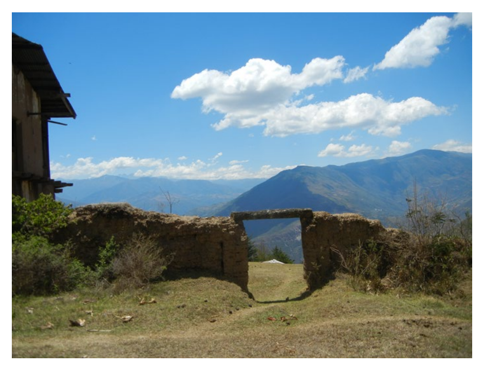
FIGURE 1. The weathered wall of an early twentieth-century hacienda estate still stands in the village of Sailapata in Ayopaya province, Bolivia.

The golden glow of adobe in the sun drew my attention to the crumbling skeleton of an old building concealed behind a row of eucalyptus trees (fig. 1). Gregorio Condorí, a Quechua farmer in his late forties whom I had joined on his agricultural tasks that day, gestured casually in their direction: "It's the hacienda house, the house of the master." This description, specifically Gregorio's ambiguous use of the present tense, points to the uncertain historical status of Mestizo-owned agrarian estates, or haciendas, in the region. Forced agrarian and domestic labor on such estates was formally abolished in 1953, but these buildings, and racial and landed hierarchies rooted in earlier subjection, remain. This essay builds on ethnographic fieldwork and archival research I carried out in Bolivia between 2010 and 2012 to explore the generative ways that the living relatives of former hacienda workers navigate this divisive labor past today. How to account for a past whose closure or pastness itself remains an open question?