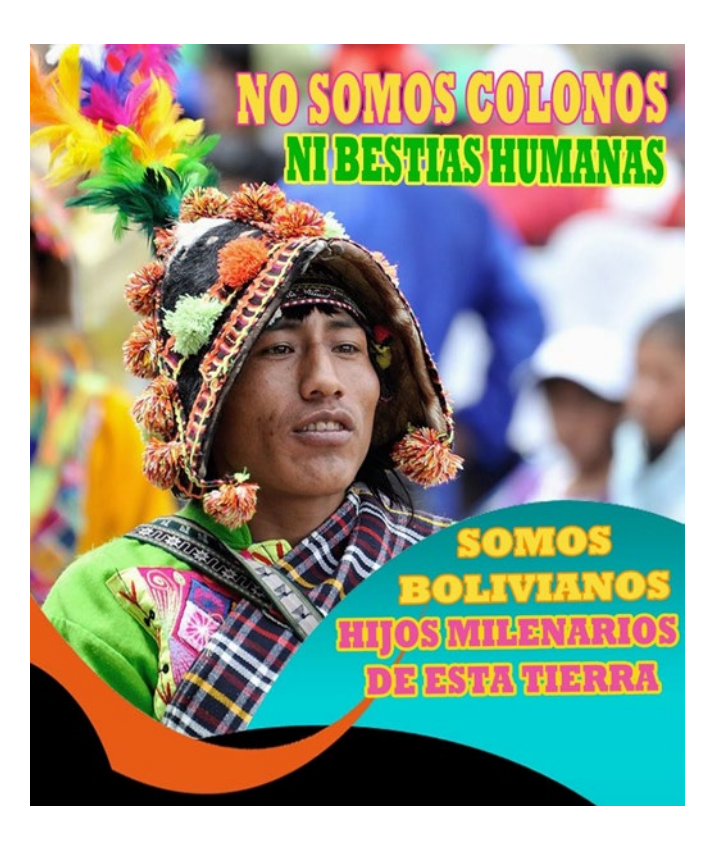
FIGURE 2. "No somos colonos, ni bestias humanas. Somos Bolivianos Hijos Milenarios de Esta Tierra." Widely circulated meme (posted publicly on former Bolivian President Evo Morales Ayma's Twitter feed, among other social media platforms) declares that as Indigenous Bolivians, "We are not colonos [indentured hacienda tenants] nor human beasts. We are Bolivians, millenarian children of this earth."

political change as deeply fragile. Not only had racial hierarchies been reproduced in contemporary labor conditions (such as mines and domestic labor) and land hierarchies, but national political discourses, too, continued to withhold full humanity from the formerly subjugated.<sup>32</sup> The fragmentation of hacienda workers into deserving and undeserving recipients of state rights and resources was replicated in the micro-dimensions of daily life. This generated abiding sensibilities of blameworthiness, evident in the tendency to describe hacienda servants as culpable for their earlier subjection. At the same time, this narrative elicited new possibilities for making demands on non-Indigenous subjects, especially landowners, who could be newly cast as backwards vis-à-vis a revolutionary telos of Indigenous inclusion and rights.