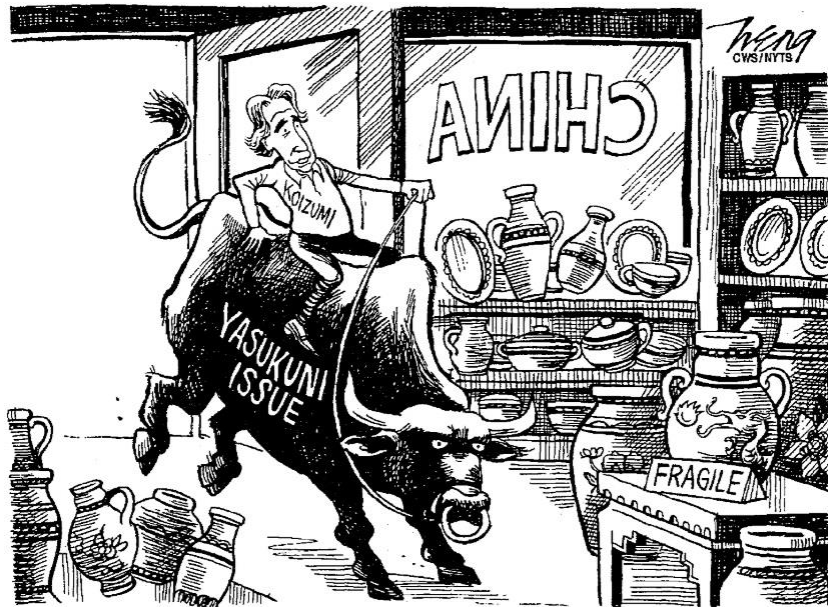
Figure 3: A Japan Times cartoon depicting PM Koizumi on a bull causing havoc in a 'China' shop (22 August 2006, p.13)

first year in office, the PM deliberately decided against visiting on 15 August, the anniversary of Japan's surrender, to avoid the inevitable controversy that such an action would ignite,