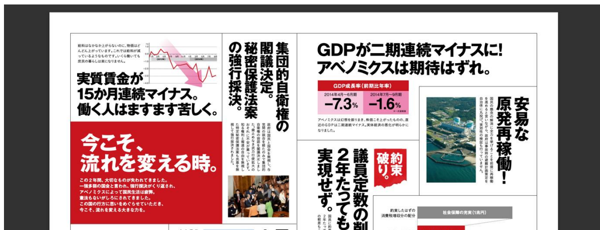
Figure 17: Pages 2 and 3 from the 2014 DPJ election manifesto

Abenomics was not the only target of the DPJ's narrative, however, and the manifesto detailed proposals for reversing what the party characterised as the LDP's disregard for the constitution and the government's sweeping legislative reform of national security. In addition, the opposition criticised the Abe administration's efforts to restart nuclear reactors without sufficient assurance that to do so would be safe, and argued that the care and nursing industry, of ever-growing importance in an aging Japan, remained underfunded. The manifesto mentioned a 'medical care breakdown crisis' ( iryō hōkai no kiki ), a 'crisis of the closing down of domestic rice-producers' ( kokusanmai nōka ni haigyō kiki ), and a 'domestic rice industry on the verge of a crisis caused by falling prices' ( beika kyūroku de kiki ni hin shiteiru kokusanmai ). Compared to the singular, positive, Abenomics-focused message of the LDP manifesto, the DPJ text attempted to present a more complex and critical assessment of the political issues that the nation faced, framing the national narrative crisis as the culmination of a variety of smaller-scale crisis created, exacerbated, or unaddressed by the current government's policies.