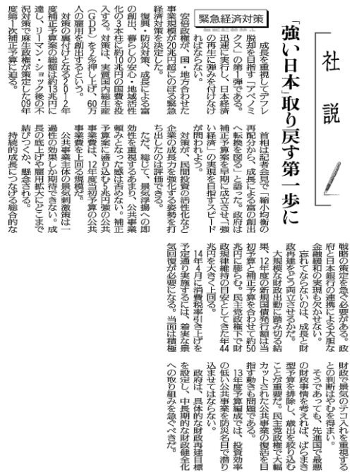
Figure 8: Yomiuri Editorial entitled 'First Step to Taking Back a 'Strong Japan', 12 January 2013

the keyword 'Abenomics' in the Yomiuri Shimbun 's online database returns 517 articles between 1 January and 1 June 2013, evidence that Abenomics was providing a successful formula for ensuring consistent and effective media projection of Abe's strategic narrative. The Yomiuri stated in a 7 January editorial that a growth strategy based upon the three arrows for 'taking back' a strong economy was the 'correct prescription' for Japan (Yomiuri Shimbun, 2013b). In another editorial on 12 January, the paper voiced its support for monetary easing,