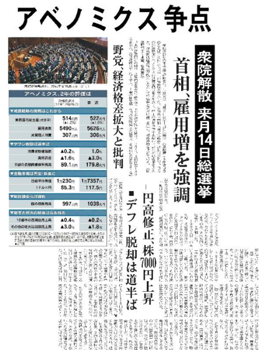
Figure 20: Front page article from the Nihon Keizai Shimbun , 22/11/2014

an attempt by the government to secure the overwhelming, two-thirds majority required to enact constitutional reform, and focused on the suddenness with which the election had materialised, leaving both the government and the opposition parties scrambling to construct their respective campaigns (Nihon Keizai Shimbun, 2014e). Also in the evening edition on 19 November, the Keizai Shimbun published short opinions from six economists and financial experts on the decision to dissolve the Diet to postpone the consumption tax hike (Nihon Keizai Shimbun, 2014c). The reaction was mixed, with the experts split in the evaluations; some argued that the postponement was a sensible decision that would preserve the growth already stimulated by Abenomics; others accused the government of short-termism, sacrificing future national economic stability for growth in the here and now. In response to Abe's announcement