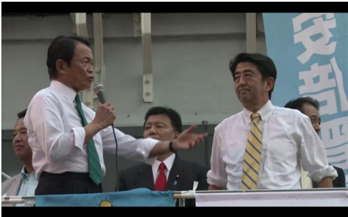
Figure 7: Abe and Asō

We are presented with the image of a politician who is quite literally signalling his intention to roll up his sleeves and get work done, a politician prepared for the rigours of the premiership. Abe waves to the crowd that has gathered in front of the bus, and is joined by a smiling Aso Taro, who has also foregone a suit jacket, seen in figure 2. Aso delivers an enthusiastic speech in support of Abe's candidacy. During his speech, Aso exhorts the crowd to use Facebook and Twitter to spread 'Abe Shinzō's story' (2:07) to their friends and around the country. Abe returns to his campaign theme of 'meeting a new morning'.