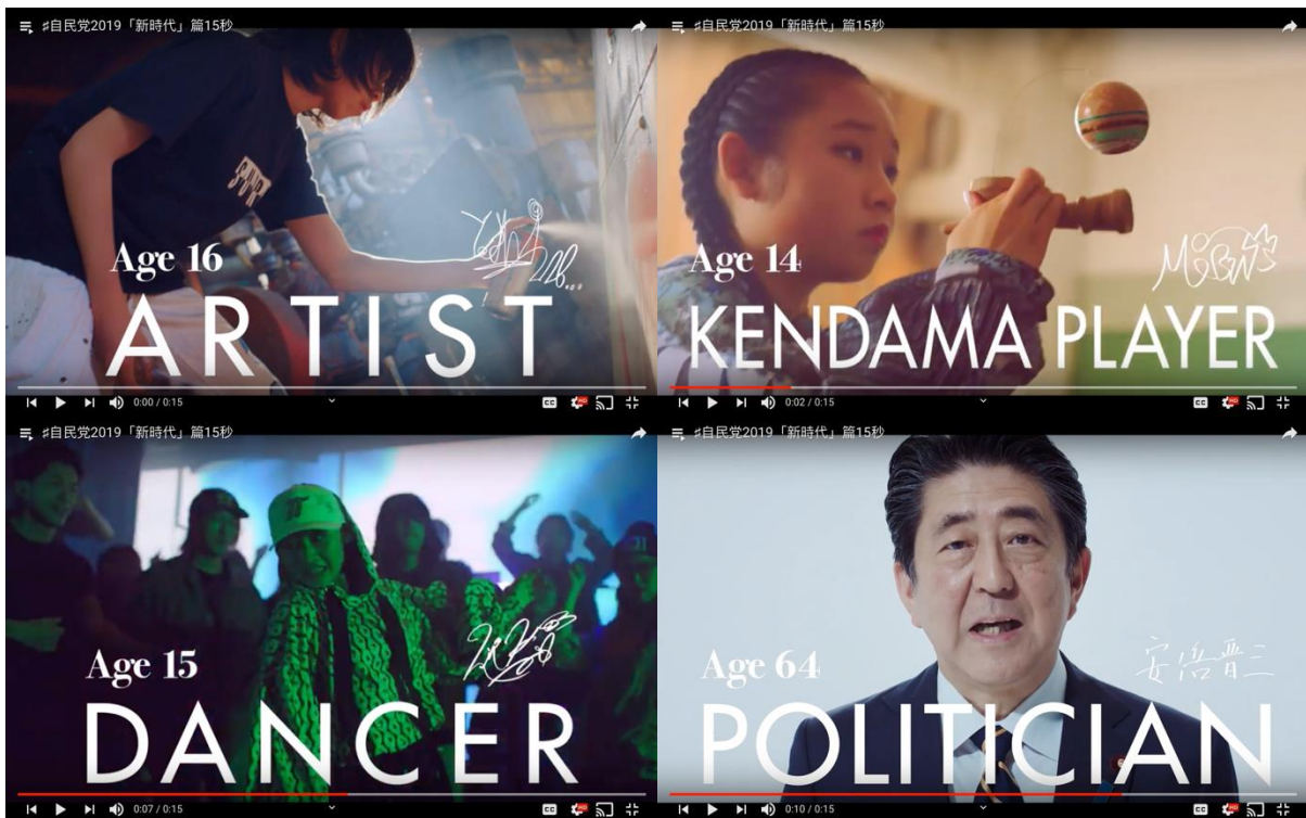
Figure 2: stills from an LDP 2019 election ad

Though recent Japanese election campaigns have been subject to the digital revolution that has impacted elections across the globe – political parties now upload a wealth of visual communication to their official YouTube channels, Twitter feeds, and Instagram profiles, as well as their own dedicated websites – obtaining comprehensive examples of visual communication published or broadcast during elections that took place prior to the current decade is a difficult proposition, all the more so when conducting research outside of Japan. Therefore, creating – and subsequently coding – an exhaustive dataset of visual communication produced during an election campaign in all its modes is impossible. Nevertheless, election campaign materials such as filmed advertisements, posters, and manifestoes have been archived on both the LDP’s official website, and Abe Shinzō’s own personal site. Therefore, although an in-depth analysis of which materials were communicated to which audiences in which sites is not possible within the scope of this thesis, it is possible to construct an overview