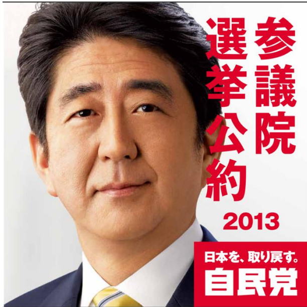
Figure 11: LDP Manifesto 2013 Title Page

A detailed analysis of every one of the LDP's pledges in each section is unnecessary: an effective narrative is not defined by the minute details, but by the picture it paints with its broad brushstrokes, its emotional proclamations, and strong personalities. The LDP manifesto is dominated by its central personality: Abe Shinzō.