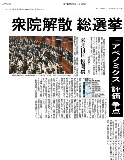
Figure 18: Front page article from the Yomiuri Shimbun,

Since the 2013 election, Abe had developed a multi-layered strategic narrative that built upon the foundations of the 2012 and 2013 'Take Back Japan' and 'Abenomics' narratives, seeking