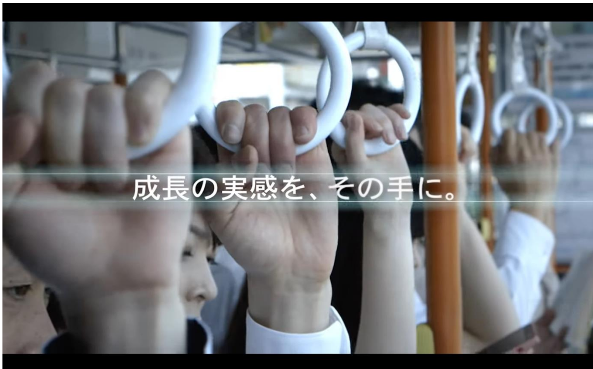
Figure 13: Still from an LDP campaign advert, with the closed caption 'with these hands, [effect] the realisation of growth'