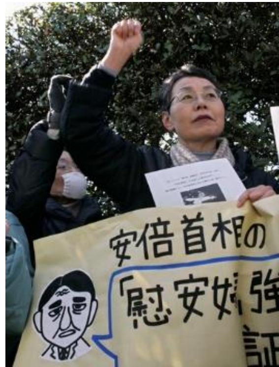
Figure 4: A demonstrator protests Shinzō Abe's remarks on the 'comfort women'

2017, Matsumura, 2007, Soh, 2008). In this instance, the ‘comfort women’ crisis was primarily one of Abe’s own making and was in seeming contradiction to what had been a conciliatory approach to foreign relations during the early months of the Abe administration. The May 2007 issue of Chūō Kōron dedicated a special collection of essays to the threat to the US-Japan alliance posed by Abe’s comments regarding the Japanese military’s wartime impressment of ‘comfort women’ (Chūō Kōron, 2007b). Abe’s comments, a response to a US