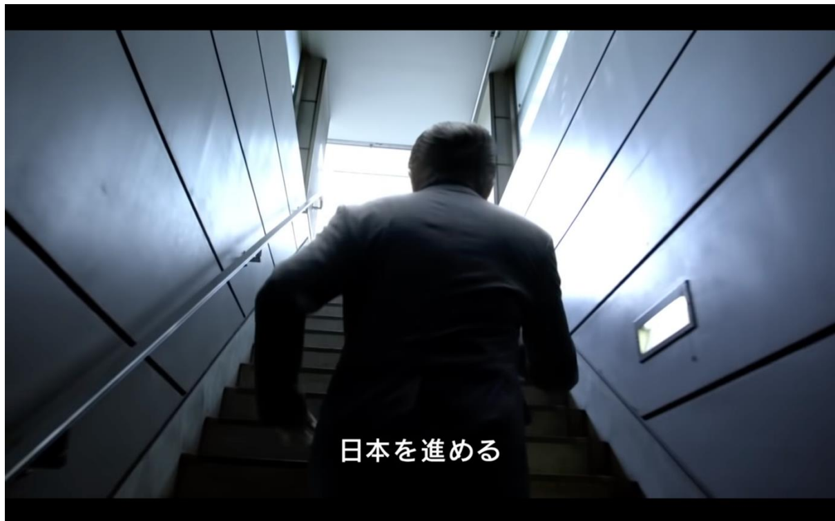
Figure 12: Abe bounding up a set of stairs with the closed caption 'drive Japan forwards'

As Abe delivers his political statement, we view the Prime Minister striding through a working farm, through an industrial scene, back streets, hallways, an office, and charging up a flight of stairs (Figure 9) before emerging onto a rooftop overlooking Tokyo, from which he delivers his final exhortation, fist clenched, to ‘take back Japan!’