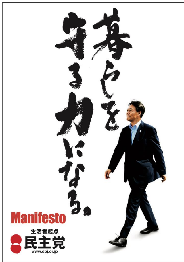
Figure 14: Title Page of the 2013 DPJ Manifesto

election focused on revitalising rural areas after the economic and physical devastation caused by the 3/11 disaster. This choice meant that the DPJ and Kaieda were seeking to appeal to a group of the electorate long considered to be LDP loyalists: rural constituents and farmers. Since the 1950s, the LDP had reliably secured the support of farmers through protectionist policies and had provided rural voters with outsized political influence through creative redrawing of electoral district boundaries (Gordon, 2009, p.278). The DPJ (and its