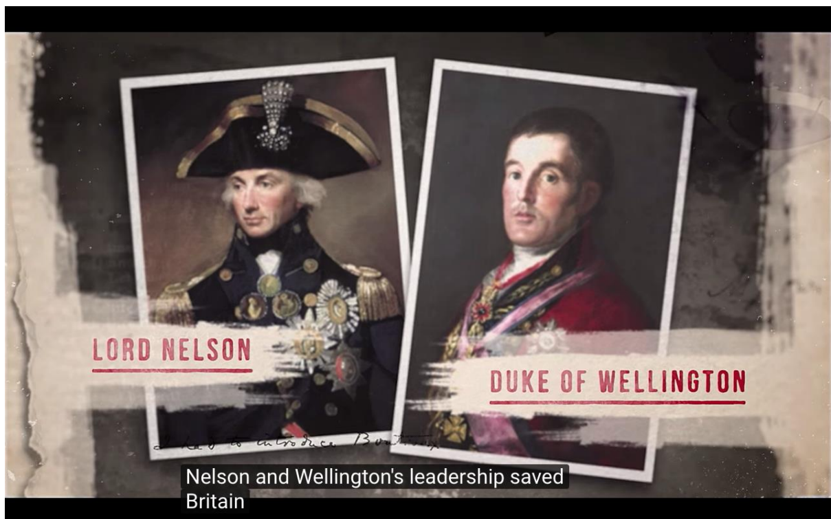
Figure 1: Screenshot from Vote Leave's 'Heroes' video

claims that ‘these British heroes changed the world,’ and urges the audience, ‘don’t believe those who talk Britain down, who say we’re too weak to control our own affairs,’ before closing with the exhortation, ‘let’s take control.’ The image of the British Isles then fades to white, and the Vote Leave logo appears against this white background. Various short taglines appear in sequence below the logo, ending once again with the phrase ‘take control.’