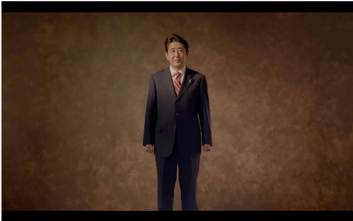
Figure 5: Abe in a 2012 LDP election campaign advert

Abe’s election campaign was centered on the promise ‘take back Japan’, but from what and where exactly was he taking the nation back? In the LDP’s official television campaign advert, broadcast nationally and uploaded to their YouTube channel, Abe sketched the central themes of the ‘take back Japan’ narrative.