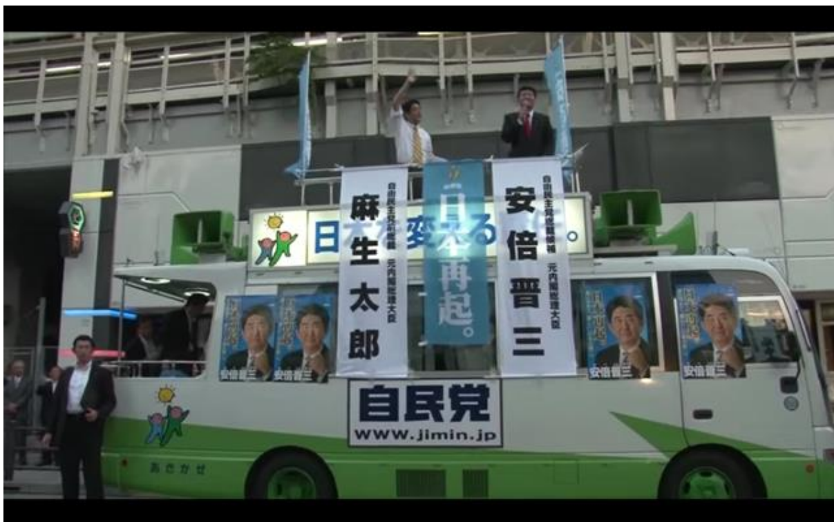
Figure 6: Abe atop a campaign bus

Abe also sought to visually reinvent himself during the 2012 campaign as an energetic leader, brimming with the vigour necessary to effectively lead a national government. Abe attempted to banish concerns that his political efficacy might be compromised by the health concerns that