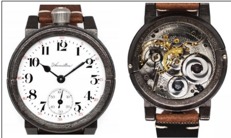
Figure 12. Vortic Watch with Hamilton Mark. 52