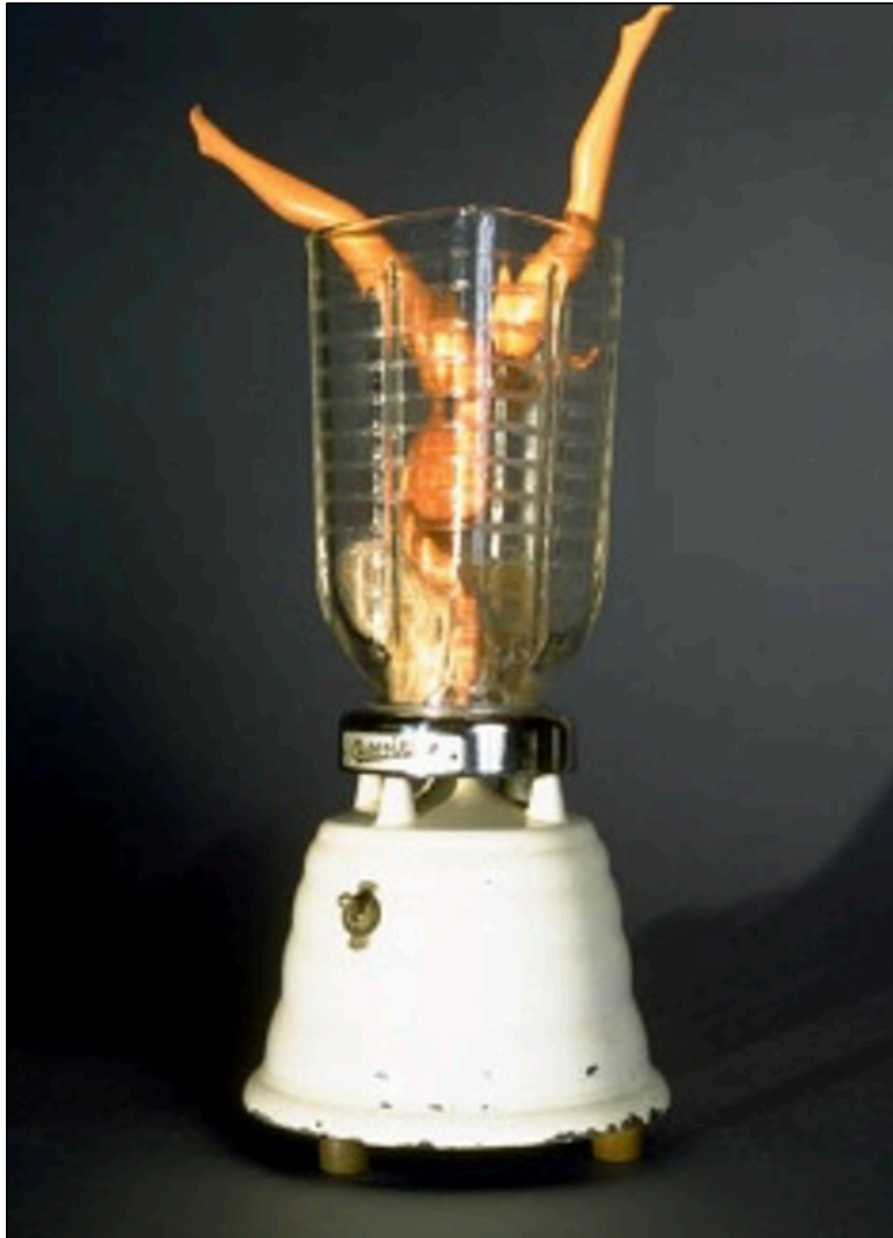
Figure 25. Food Chain Barbie (Blender). 111

destruction or reuse of a trademarked good precisely to comment on the brand itself, such as when an artist puts a Barbie doll in a blender or an enchilada. 110