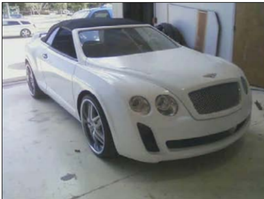
Figure 15. Vehicle Modified to Resemble a Bentley. 65

And Ferrari sued another body-kit maker for transforming a Pontiac Fiero into a Ferrari look-alike. 66