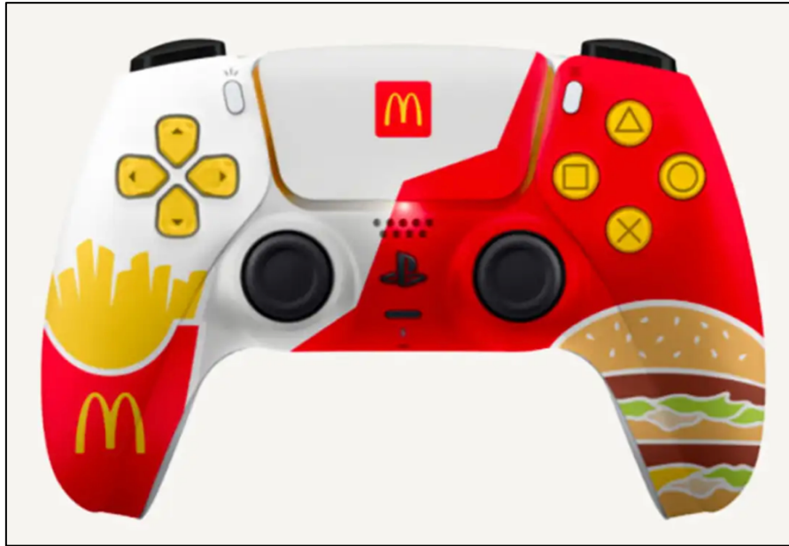
Figure 2. McDonald's-Branded PlayStation Controller. 7

We call this phenomenon “aftermarket customization.”