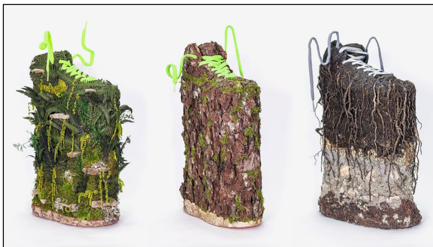
Figure 8. Tropical, Captain Wood, and Fossil. 35

Not all sneaker customizations are works of footwear fine art. The vast and growing aftermarket for customized footwear encompasses a broad spectrum of alterations, additions, and redesigns. Customizers, as they're known within sneaker culture, purchase branded sneakers (sometimes counterfeits, which is problematic for its own reasons) and apply their own colorways, illustrations, and design elements. 36 For instance, Drip Creationz, a California-based customizer, altered Nike Air Force 1 sneakers with new fabrics and print designs, from bandanas and butterflies to Chester, the Cheetos Cheetah. 37 And the Shoe Bakery sold "Red Velvet Sneakers": genuine Nike Air Force 1s customized to look like a frosted cake. 38