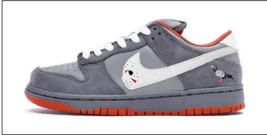
Figure 28. Jeff Staple’s NYC Pigeon Nike Dunk Low Pro SB. 123