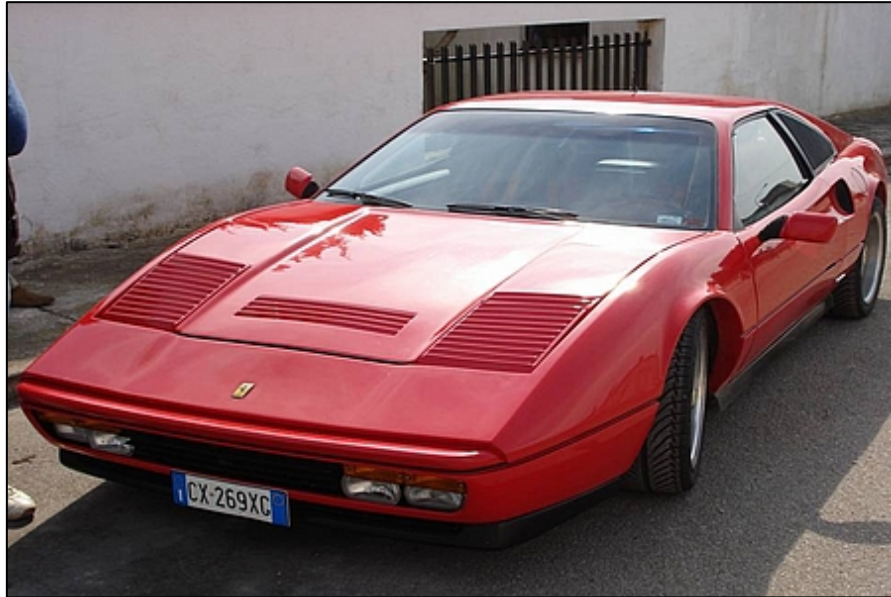
Figure 16. Vehicle Modified to Resemble a Ferrari. 67