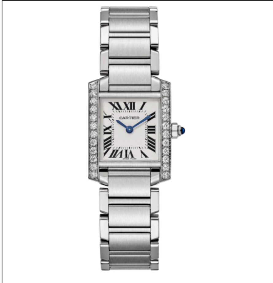
Figure 10. Cartier Tank Française Watch. 47

did not limit the jeweler from making the same sorts of changes, if requested by a customer, to a watch that customer already owns. See Symbolix , 454 F. Supp. 2d at 186.