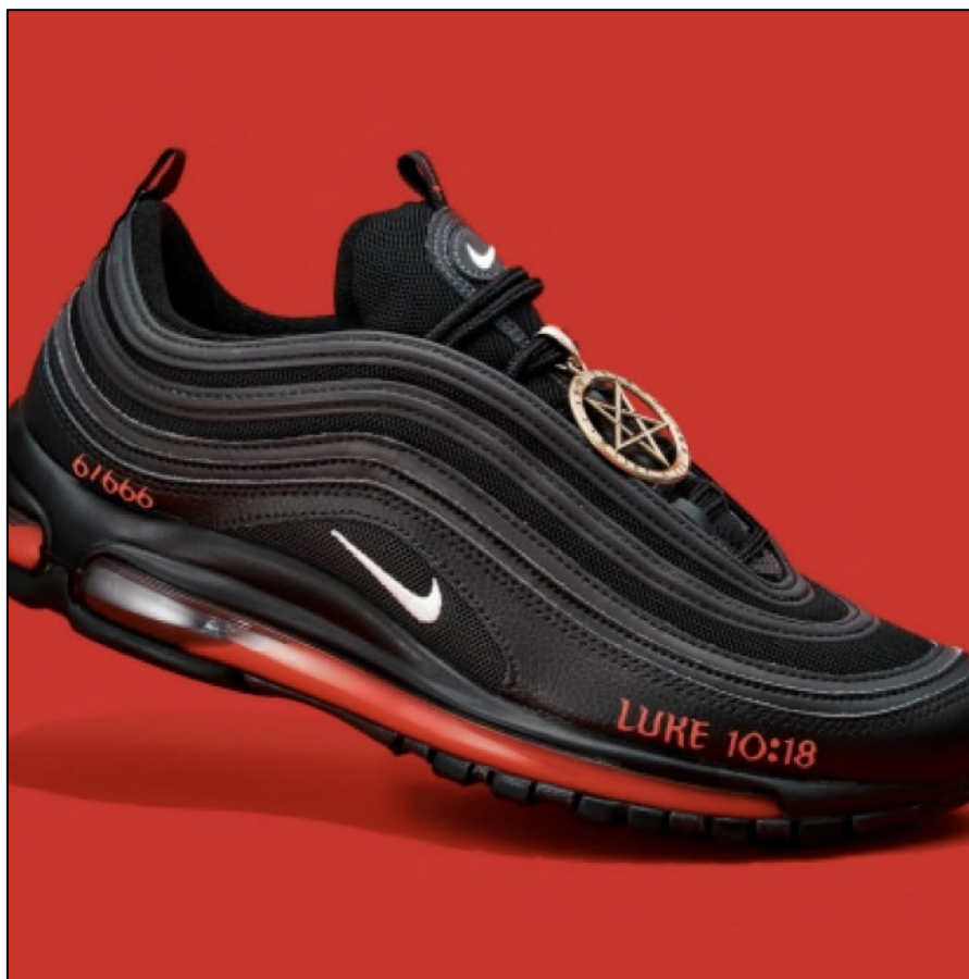
Figure 1. Satan Shoes by Lil Nas X. 3

Nike was not amused. It sued for trademark infringement. 4 The parties quickly settled with an agreement by Lil Nas X's manufacturing partner, MSCHF, to "recall" the shoes—a largely meaningless gesture, since no buyer was under an obligation to return them. 5