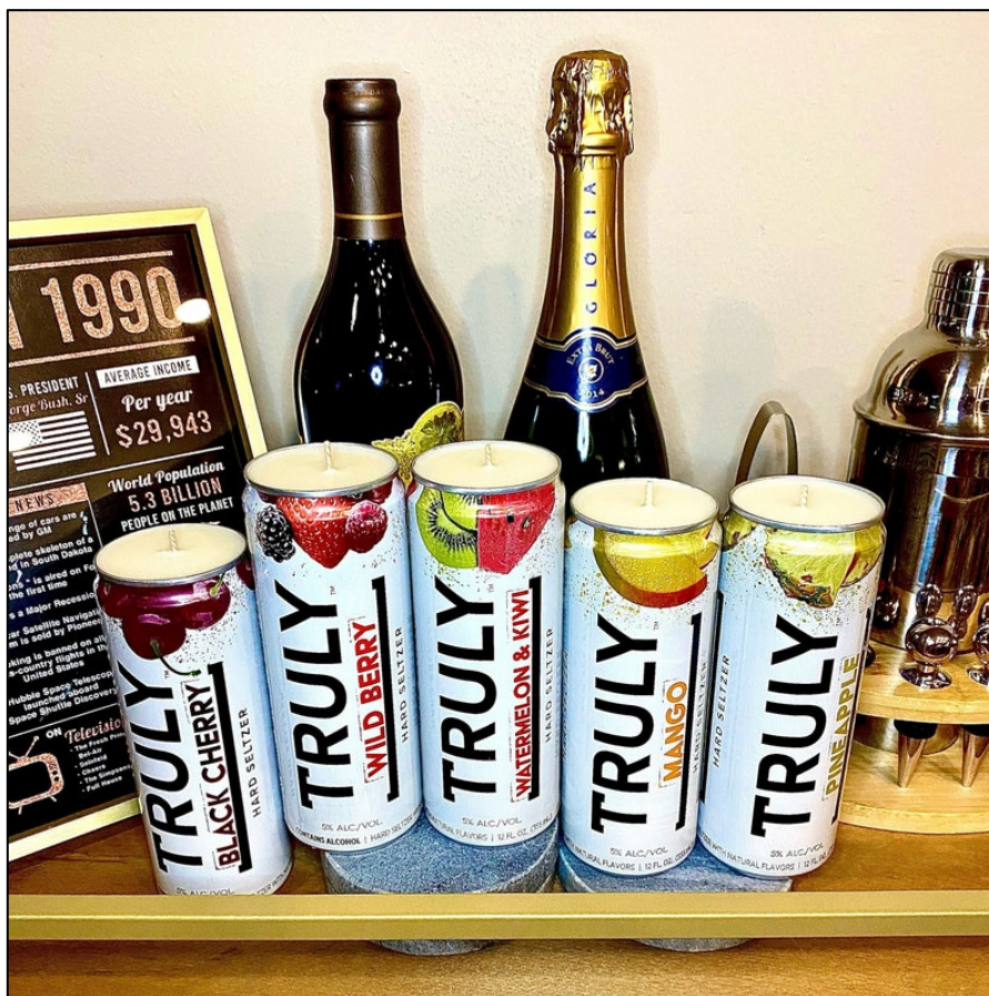
Figure 21. Upcycled Hard Seltzer Cans Made into Candles. 79