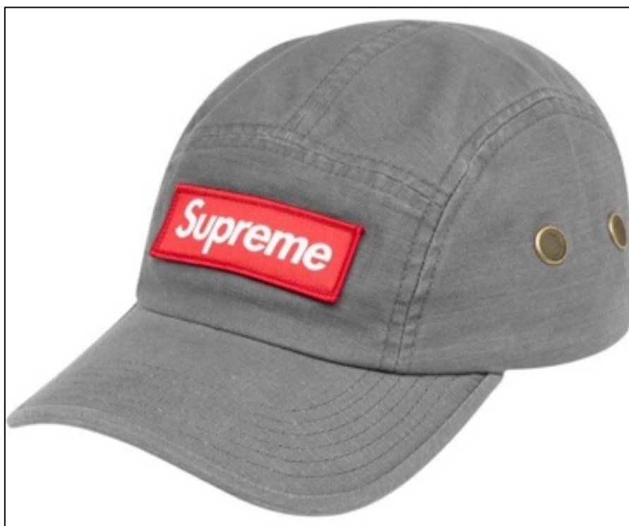
18 Figure 4. Gray Supreme Hat.

Photograph of Gray Supreme Hat, in Supreme Military Camp Cap , FARFETCH, https://www.farfetch.com/shopping/women/supreme-military-camp-cap-item-16943787.aspx [ https://perma.cc/35JR-VZZC ] (last visited Feb. 10, 2023).