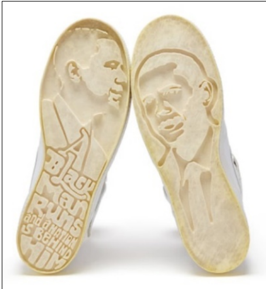
Figure 5. Obama Force One. 27

Lasser created these custom Nike Air Force 1 sneakers to “mark what he considered to be the most significant moment in the history of his generation, the election of President Obama.” 28 Lasser “took a pair of iconic Nike Air Force 1s and transformed them into a commemorative sculpture” by adding “customized rubber soles” engraved with two portraits of President Obama and the phrase, “A Black Man Runs and a Nation is Behind Him.” 29 Lasser’s Obama