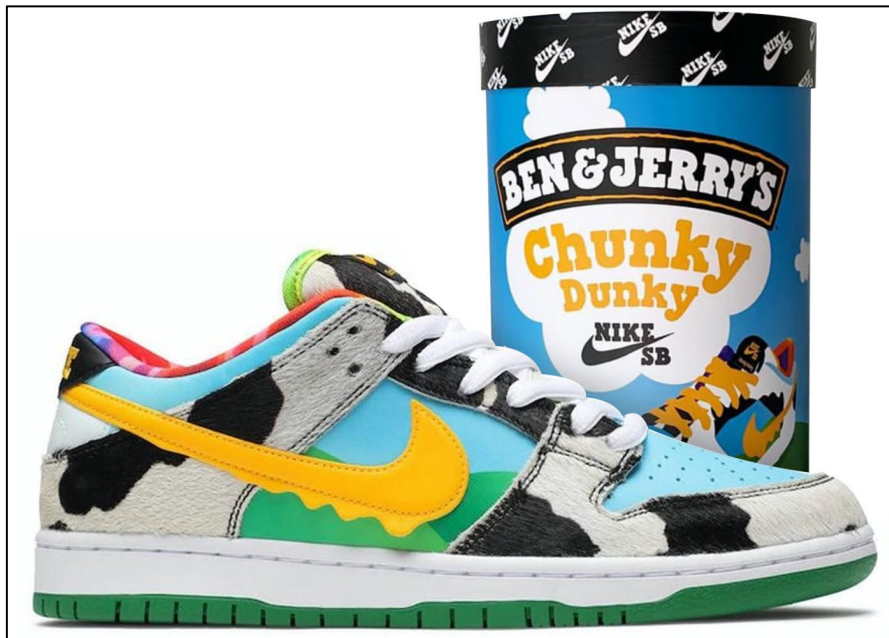
Figure 29. Nike and Ben & Jerry's Chunky Dunky Ice Cream-Sneaker Collaboration. 156

It is cobranding that provides the strongest possible theory for trademark owners to use against aftermarket customizers. If customers are conditioned to expect cobranding relationships, they may look at some aftermarket customizations and assume the trademark owner has agreed to the deal. That is particularly likely when the aftermarket customizer is a large company like McDonald's. Consumers may think it unlikely that McDonald's just decided to buy and paint PS5 controllers without Sony being in on it (but, in fact, it turned out to have done just that). Confusion as to sponsorship may also be stronger when the plaintiff participates in the customization aftermarket through official artist collaborations. If Nike allows certain customizations of its Air Force 1 sneakers 157 or Louis Vuitton partners with artists to generate custom versions of