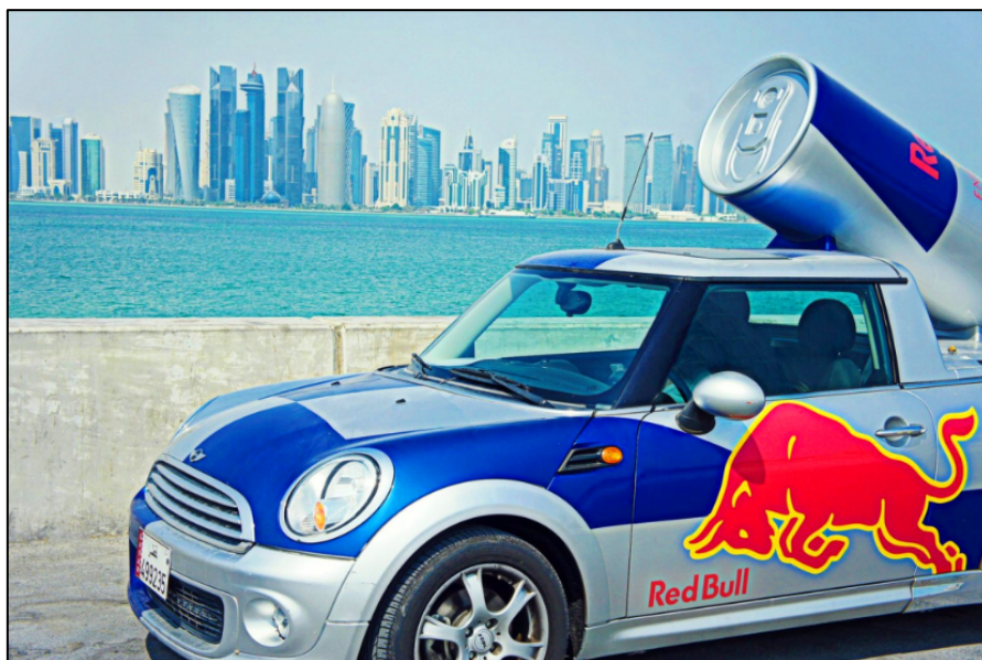
Figure 13. Red Bull “Wings Team” Mini Cooper. 55