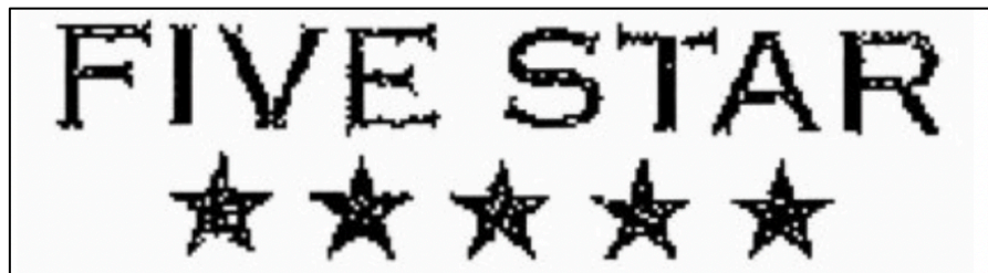
FIVE STAR, Registration No. 4,235,401.