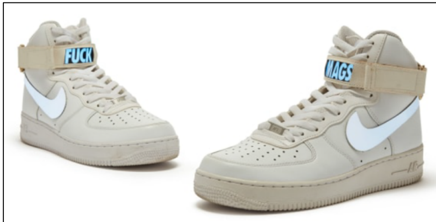
33 Figure 7. Fuck Mags.

Photograph of Nicholas Avery’s Fuck Mags , in Theheyman, Fuck Mags , 2012, PHILLIPS, https://www.phillips.com/detail/theheyman/NY011118/8 [ https://perma.cc/B785-AHS7 ] (last visited Feb. 10, 2023).