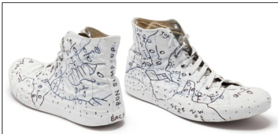
Photograph of Shantell Martin’s Converse All Stars, in Shantell Martin’s Worn and Drawn Upon Converse All Stars , PHILLIPS, https://www.phillips.com/detail/shantell-martin/NY011118/3 [ https://perma.cc/YPP3-ABV6 ] (last visited Feb. 10, 2023).