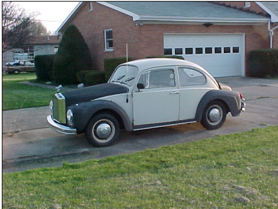
Figure 22. The “Rolls-Beetle” Conversion. 93

Much like the first line of watch cases, the plaintiff in body kit cases is almost always the maker of the car being imitated—the Ferrari or the Rolls-Royce. Manufacturers of the base car that is being customized—the Pontiac or