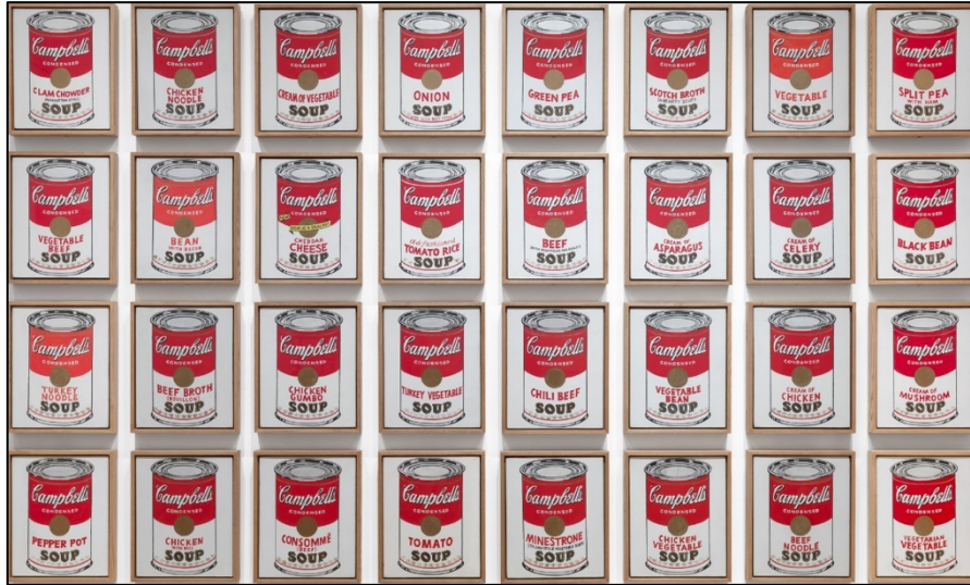
Figure 31. Andy Warhol's Campbell's Soup Cans . 300

That is true even though Andy Warhol made his own images of Campbell's marks.