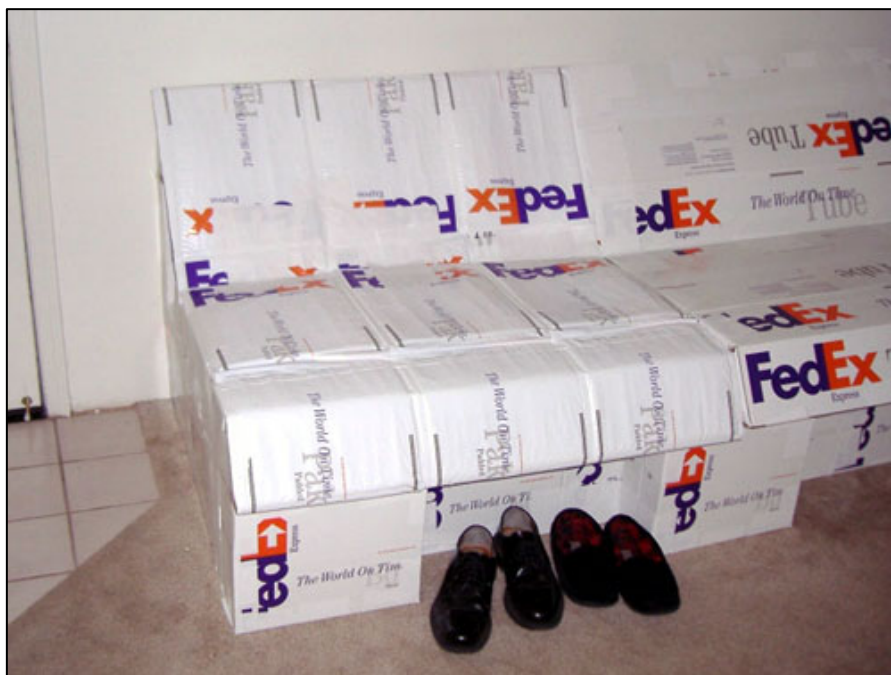
Figure 23. Couch Built from Free FedEx Boxes. 95

Chanel recently sued Shiver + Duke, an accessories retailer, for making costume jewelry from “upcycled” Chanel buttons, 96 and Pepsi has sued over the use of its recycled cans as clever drug stash devices. 97