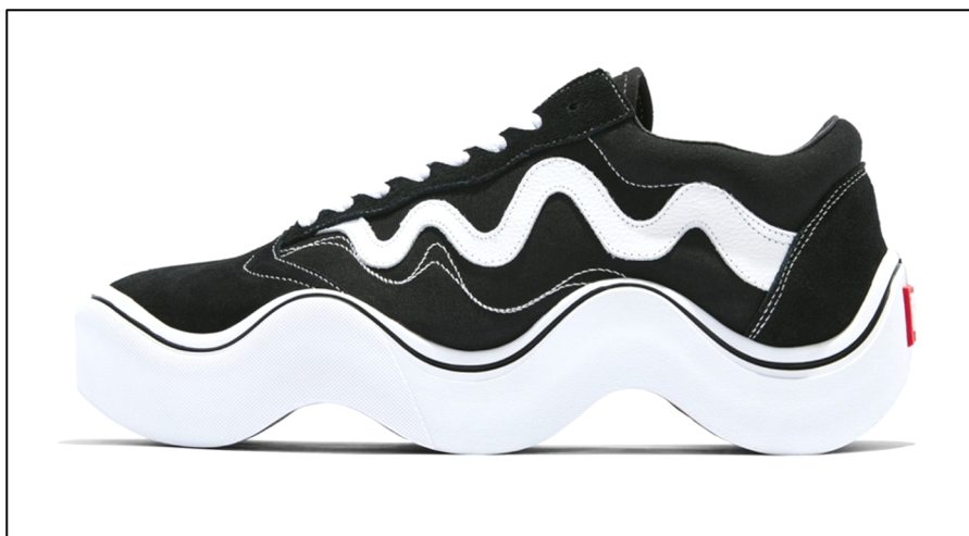
Figure 32. Wavy Baby Sneaker.

Photograph of Wavy Baby Sneaker, in Complaint at 3, Vans, Inc. , 602 F. Supp. 3d 358 (No. 22-CV-2156).