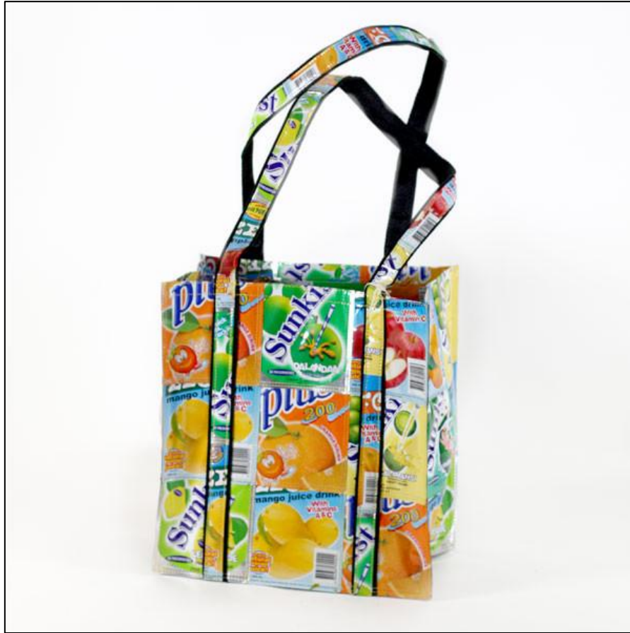
Figure 17. Basura Recycled Juice Bag. 75

Much like Basura bags, many upcycled goods prominently feature the logos of their recycled components.