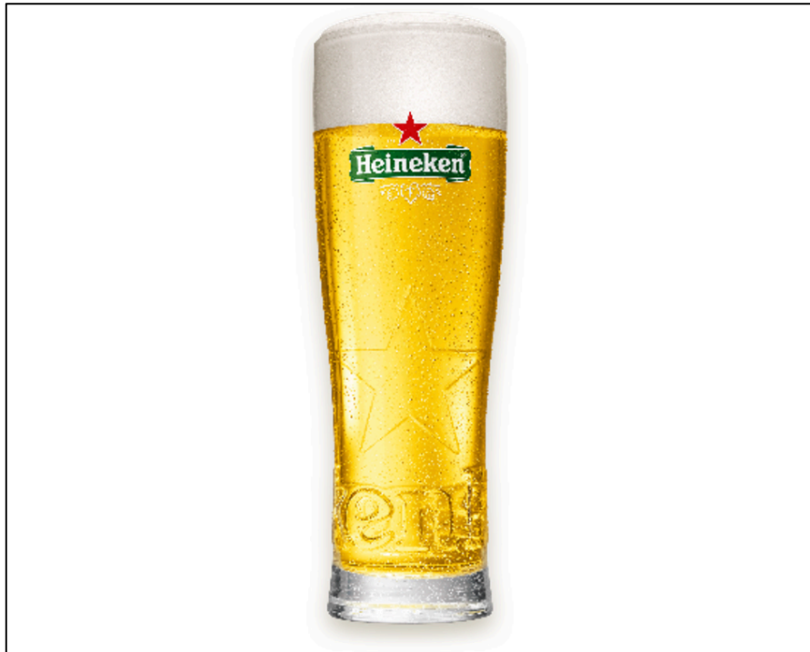
Figure 24. Official Promotional Heineken Beer Glass. 100

Other times, the application of trademark law to aftermarket customization seems confused. For example, some courts have found liability for including genuine component products in an end good even when the maker truthfully told consumers it had done so. In Suzuki Motor Corp. v. Jiujiang Hison Motor Boat Mfg. Co. , 101 the defendant installed a genuine Suzuki snowmobile engine as the power plant in the defendant's inboard motorboat. Because the engine was used for a purpose for which it was not designed, the court held that damage to plaintiff's reputation could result and granted a temporary restraining order