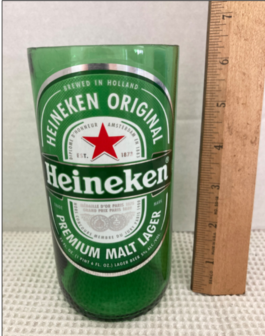
Figure 20. Upcycled Heineken Bottle Made into Drinking Glass. 78

Other artisans have turned hard seltzer cans into “can-dles.”