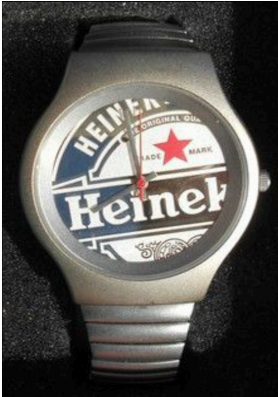
Figure 19. Upcycled Heineken Bottle Cap Watch. 77

Others might turn the used bottle itself into a drinking glass.