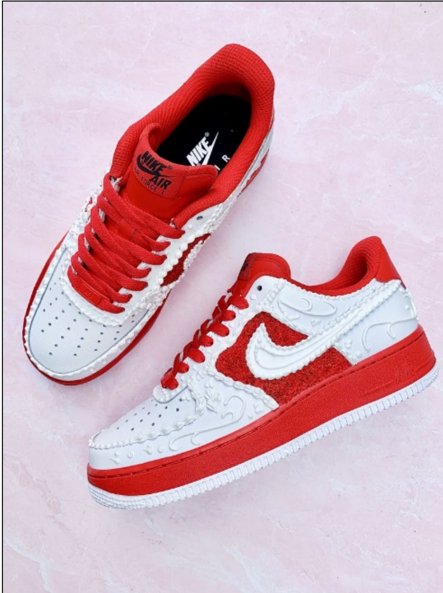
Figure 9. Red Velvet Cake Sneakers. 39

Brands themselves also participate in custom sneaker culture. 40 Nike has engaged in collaborations with a number of sneaker artists to create and sell