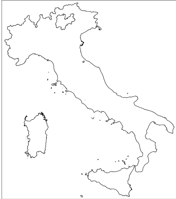
Figure 1 - The study area: the Trento province.

The area of Trento province, according to its geographical and climatic gradients, can be divided into three zones: endalpica , mesalpica and esalpica [Odasso, 2002]. The endalpica zone includes upland areas with higher elevation and landlocked valleys. There are environments with harsh continental climate, particularly favourable to forest communities dominated by boreal conifers like Norway spruce ( Picea abies ) or cembro pine ( Pinus cembra ). The mesalpica zone include mountains with relatively lower elevations, generally found on plateaus and in valleys, typically with East-West orientation and with average elevation around 1000 m a.s.l. Cool climate, from sub-continental to sub-oceanic, characterizes this zone, where forests are dominated by mesophile tree species like silver fir ( Abies alba ) and beech ( Fagus sylvatica ). The esalpica zone is concentrated in a central strip orientated North-South in the Trento province territory, with elevation below 1000 m a.s.l., characterized by incursions of species with sub-Mediterranean or steppe character, dominated by the forests composed of thermophile broad leaved trees ( Ostrya carpinifolia , Carpinus betulus , Fraxinus ornus , Quercus pubescens , Quercus petrae , etc.).