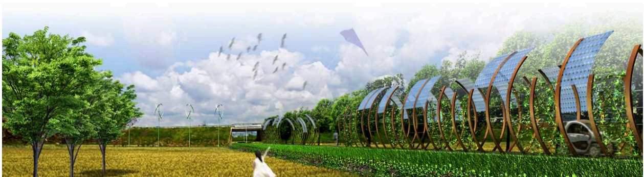
Figure 4: The proposal of Effequattro Studio – Natural born green boulevard (2012)

The proposed approach aims at integrated rehabilitation processes of infrastructures and stations, to overcome the tendency to identify greenways exclusively with the bike or pedestrian paths design. The goal is not a restyling of disused railway network, but the activation of regeneration processes and local development, linking local resources and increasing equipments and services in the area. The national scenario shows, on the one hand, the dimension of the disused railway heritage, on the other hand, the action and the commitment of cultural and social stakeholders that support initiatives aimed at raising knowledge of this heritage, promoting its valorisation in order to give it back to the community. This characteristic is an opportunity to build shared strategies of wider valorisation. However, it is necessary the support of adequate policies, programs and technical-regulatory tools and commitment of the political agenda.