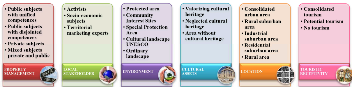
Figure 1: Scheme of variables

Furthermore, in order to ensure the economic feasibility of a wide national program, it is necessary that policy makers are able to trigger processes of partnership with local socio-economic stakeholders and to attract private capital that can contribute to develop initiatives and to manage reused heritage.