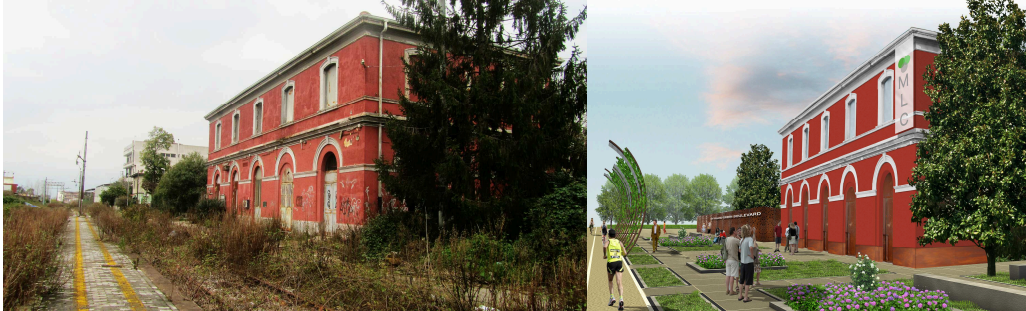
Figure 3: The proposal of Effequattro Studio – The Ottaviano Station, state of fact and the state of project (2012)

An important chapter was dedicated to the possible managing of the greenways and the necessary funding for its implementation: regarding the managing would be important to be able to involve the community already active in the area, giving wide space to associations, consortia, small entrepreneurs and the citizens themselves, who could become the main actors in the development process provided that they are supported by appropriate institutional administrative structure. In this sense, the stations, properly designed in a flexible way, could be the places in which to accommodate temporary social and cultural activities, exhibitions, sales of local products from local to farmers markets.