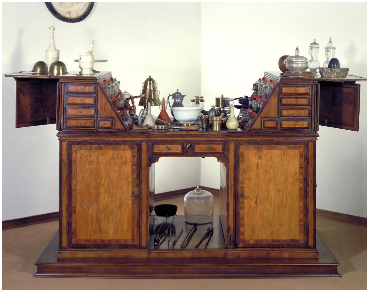
Fig. 1: Leopold's chemistry cabinet. Museo Galileo, Room X.

bellow operated by pedals useful for calcination and combustion operations. Various shelves allowed to store glassware, tiny bottles, and chemical compounds (Fig. 1).