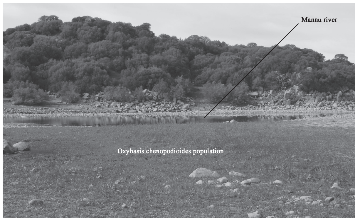
Figure 1: Oxybasis chenopodioides population along the Manu river (near Lake Coghinas), at locality Muros, in Olbia-Tempio Province of Sardinia.

winter, with rain) and emersion (during the summer and autumn). The life cycle is short, 2–3(–4) months between August and November, and is completed during the submersion phase. Soil is humid, scarcely evolved, scarcely structured and with a fine texture (pers. obs.). O. chenopodioides frequently grows along sandy coastal habitats near the sea level, even though (for example in Sardinia; see Iamónico & Calvia 2010) it may be also found far from the coast line, up to 160–180 m a.s.l. (Fig. 1). During the later summer, O. chenopodioides can be often found from halophilous vegetation communities ascribed to the class