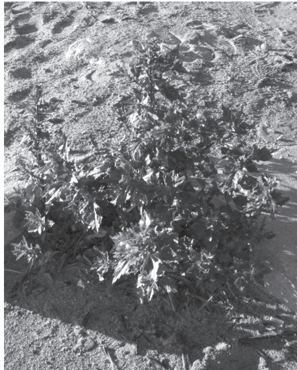
Figure 3: Oxybasis rubra in sandy substrate in Savona Province of Liguria Region, north-western Italy.

Oxybasis rubra has a wider distribution in Italy than O. chenopodioides since it appears to have a