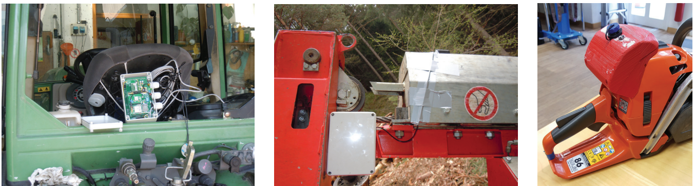
Figure 1. Three developed FDLs: On the left side the Tractor-FDL, in the center the Yarder-FDL, and on the right side the Chainsaw-FDL. The Tractor-FDL is the energy supplied by the electric circuit of the tractor, while the others foreseen the use of external batteries.

Abbildung 1. Die Abbildungen zeigen die drei FDL: links der Traktor-FDL, in der Mitte der Kippmastgerät-FDL und rechts der Kettensägen-FDL. Der Traktor-FDL wird durch den Stromkreis des Traktors mit Energie versorgt, während die anderen die Verwendung von externen Batterien vorsehen.