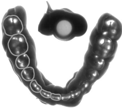
Figure 1. Scanned image of the occlusal registration (mandibular surface facing downward) in one orthodontic patient. On the left side is an example of manual insulation of each single tooth.

ing a diabase control plane with comparator. The mean error was \pm 20 \mu\text{m} . The calibration step wedges were scanned and analyzed with Image Pro Plus software (Media Cybernetics Inc, Silver Spring, Md). A gray-scale value according to the pixel density was obtained (ie, the thickness of the sample). Using a physical theoretical approach to the phenomenon of light absorbance through a material, we defined an equation that fit with our data as