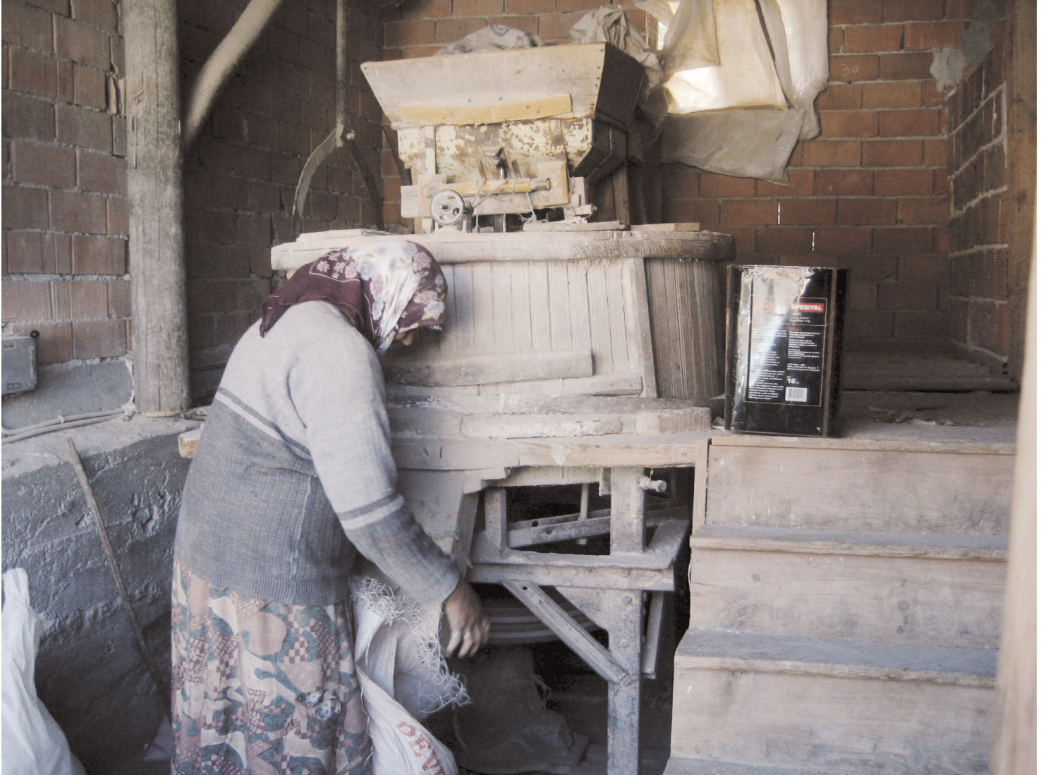
FIGURE 4 Emmer milled by a traditional miller in a village in Kastamonu.

come to the city market. The bulgur is sold in small quantities on the market only during the month of September, after harvesting, for a total of 1 to 3 tonnes of emmer bulgur per farmer-trader each year.