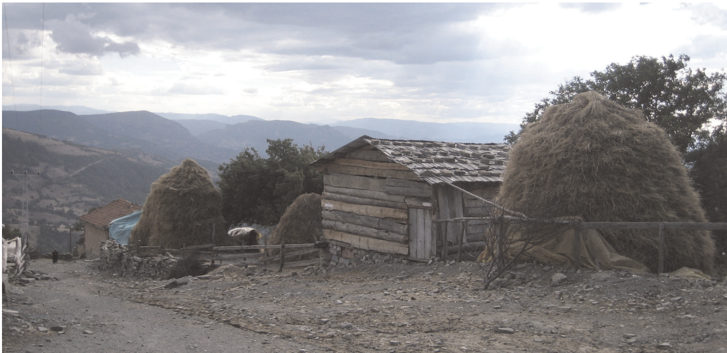
FIGURE 2 Village of emmer farmers in Sinop province.

emmer production. Despite the low income generated by emmer production, this figure shows the marginal but important role that emmer plays in the household economy in this region. Emmer cultivation techniques are transmitted from generation to generation without any formal training. The major problem faced by emmer farmers is threshing, due to the hulled grain, followed by transport of harvested grain from the steep fields to the mountain villages.