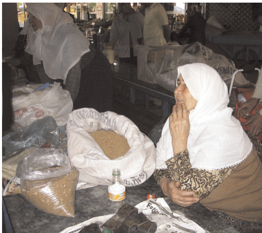
FIGURE 5 Emmer bulgur sold in Kastamonu market.