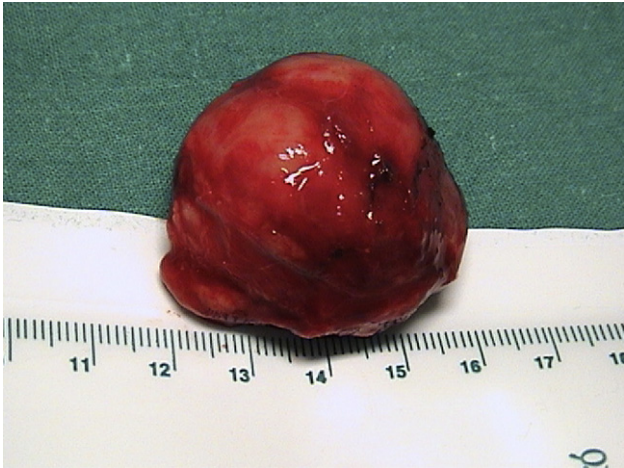
Fig. 1. Gross findings of lymph node.

The Castleman's disease may grow in any area where lymphoid tissue is normally present but the most frequent is mediastinal (67%), 5 the abdomen is rarely affected by this pathology; abdominal localizations reported in the literature are: mesentery, retroperitoneum, pancreas, pelvis, rectum, however, being mesenteric and perinephric sites the most frequent in pelvis. 3 The retroperitoneal location of the CD is extremely rare presenting only 7% of cases, 6 usually at the left side. In the literature in fact the ratio between the right and left location is equal to 13:4. 7 In our case the CD was localized in the right paramedian site.