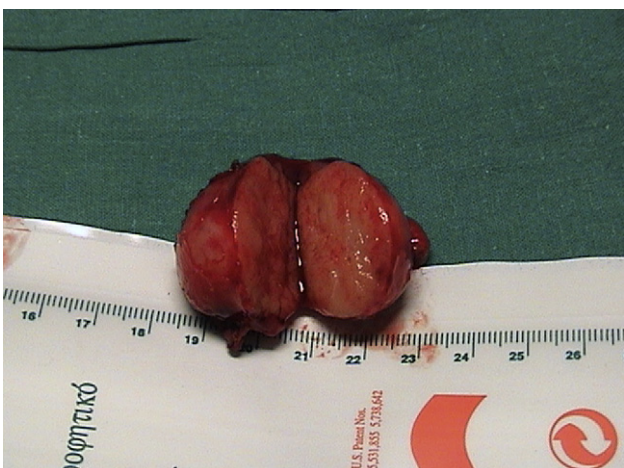
Fig. 2. Gross findings of lymph node.

The Human Herpes Virus 8 (HHV-8) is the causative agent of Kaposi's sarcoma in immunosuppressed subjects, 14 this virus was also frequently found in HIV+ and patients suffering from CD 15 and so it is possible to affirm that it can play an important role in the pathogenesis of Kaposi's sarcoma as well as the multicentric form of CD. In our case, the patient had anti-HHV-8 and also had a history of numerous reported incidents of herpetic infection, which could further support the view that this virus might be somehow involved in the pathogenesis of CD. The hypothesis that the IL-6 may play an important role in the pathogenesis of CD is supported by the fact that the HHV-8 has a gene coding for a protein similar to IL-6 (VIL-6) 16 which could be responsible for the clinical-pathological anatomy typical of CD. 17