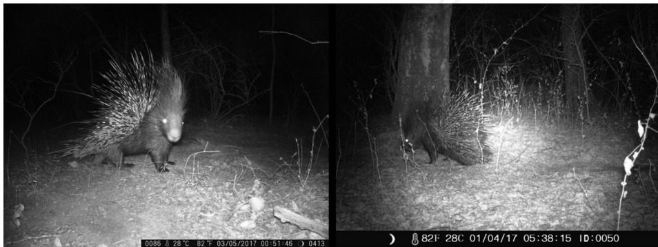
Figure 1. Individuals of crested porcupine camera-trapped in northern Benin.

*Significant selection (positive sign) or avoidance (negative sign).