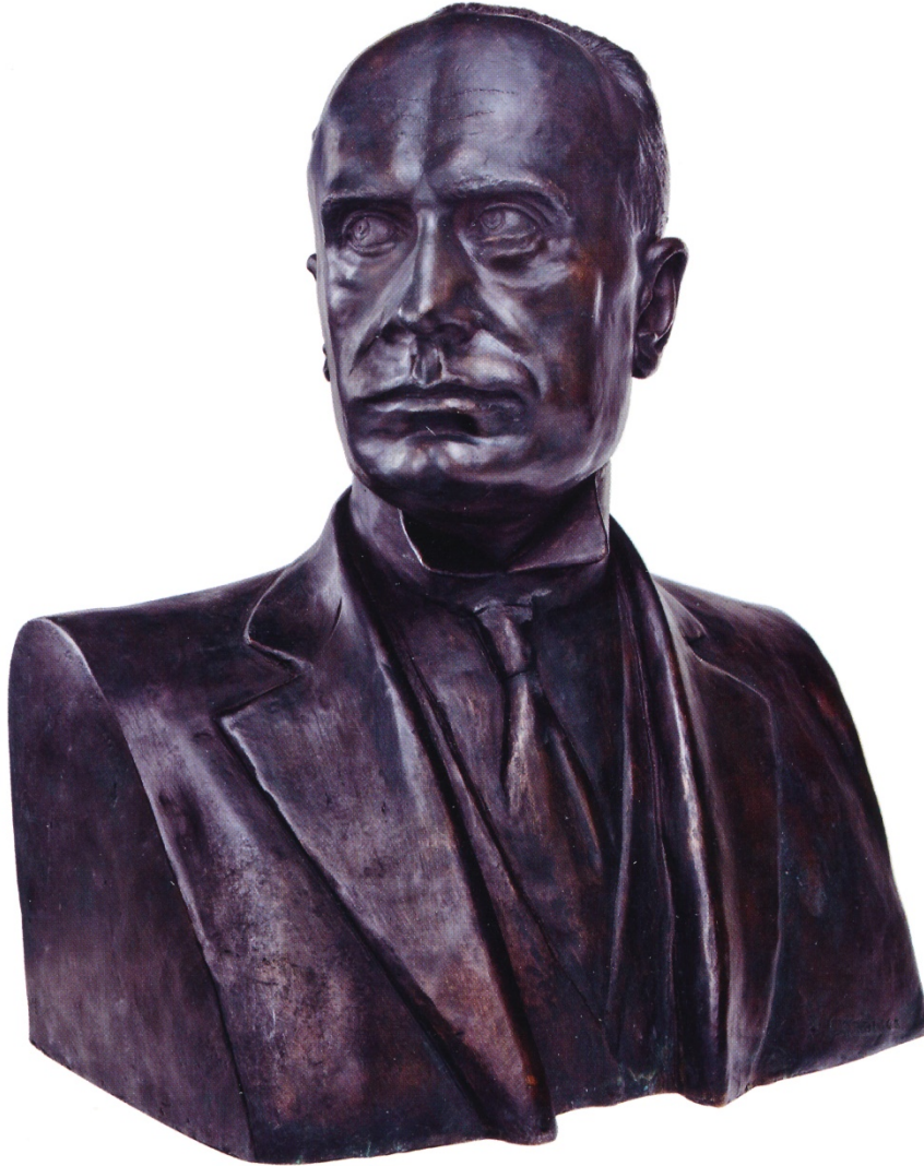
Figure 2. Pietro Canonica, Mussolini , bronze, 1926, cm 43x60x33, Museo MAGI'900, Pieve di Cento.

unknown aspect of the history of collecting in Italy ” (Pieri 2015: 236). This portrait of Mussolini dates back to 1926 and shows a humanized leader, close to contemporary portraits of aristocratic personalities portrayed by Canonica at that time: the Duce is in a suit and tie like any bourgeois worker, his face is concentrated and slightly contracted, while his eyes are turned towards an imaginary interlocutor.