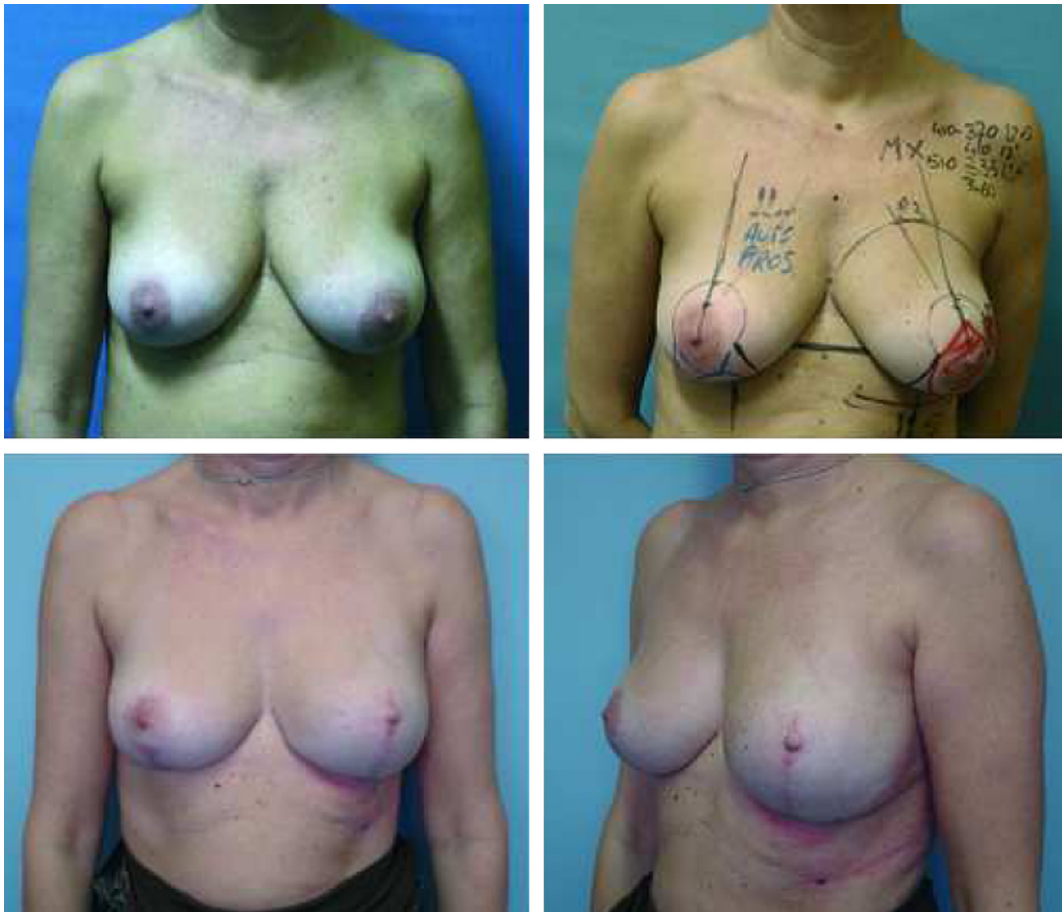
Fig. 3. Immediate one-stage breast reconstruction (skin reducing mastectomy). Large and ptotic breast needs to be reduced and lifted (above left). A reduction mastectomy with autoprosthesis modified technique is planned contra-laterally (above right). Below: After mastectomy and extra-projection implant insertion on the left side and reduction mastectomy on the right side.

Capsular contracture and implant replacement were also investigated. Thirty-two (13.4%) of patients in the Delgado et al. study 2 developed a Baker Grade III after a mean follow-up of 16 months. In our series, 15.5% of the patients developed