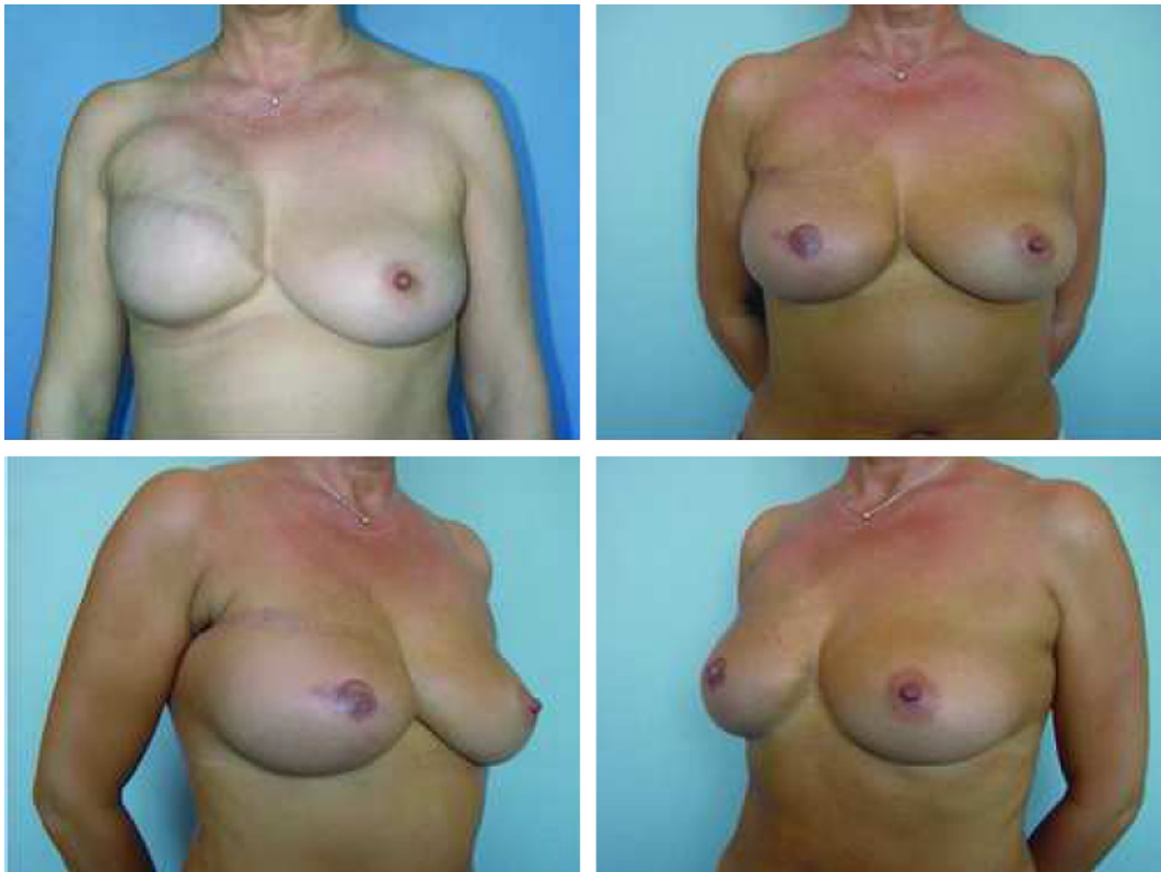
Fig. 1. Immediate two-stage breast reconstruction. One of the few cases in which youthful appearance of the contra-lateral breast can be matched without performing any contra-lateral adjustment. Above left: After expander insertion 600 cc. Above right and below: After extra-projection implant insertion and sub-mammary fold reconstruction.

Breast reconstructions were planned in the past with the purpose to rebuild an identical and possibly symmetrical breast mound. Several authors, for example, favoured autologous flaps that produce a natural symmetry even with