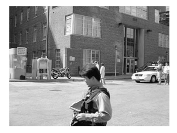
Fig. 4 Mobile wireless imaging system