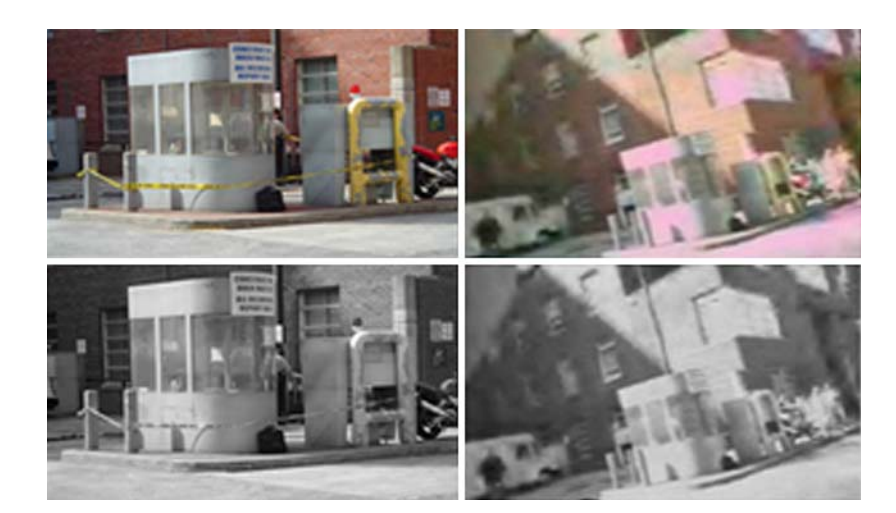
Fig. 2 Comparison of bandwidth effects of video and still imagery

Fig. 3 Images from exercise show field and telecommunication events