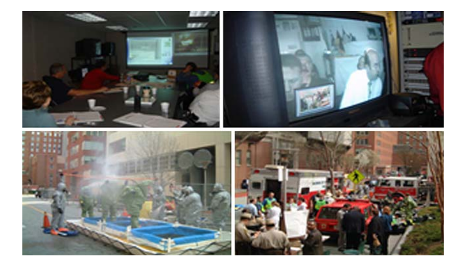
Fig. 3 Images from exercise show field and telecommunication events

Fig. 2 Comparison of bandwidth effects of video and still imagery