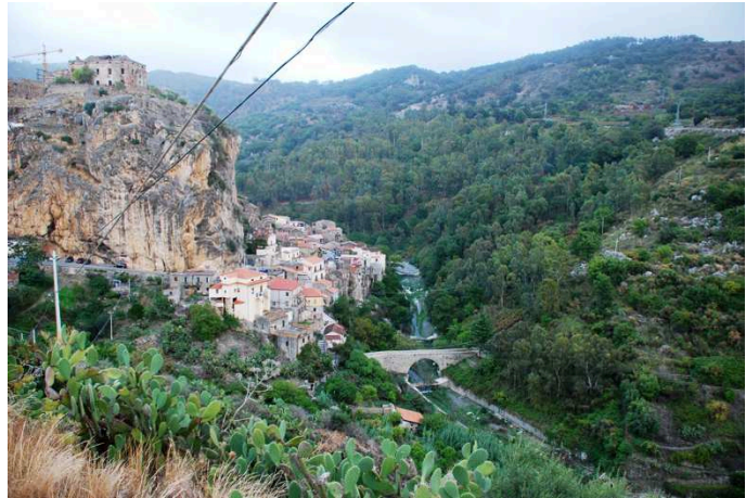
Fig. 3: Historic Center of Palizzi, the fortress and the “fiumara”

The rivers have influenced the settlement pattern of these territories, in fact many of the inhabited centers are located close to the river-beds which are, at the same time, a mean of communication to the coast, a source of water supply for the irrigation of the fields, a reserve of building materials and a level place to grow. It is therefore evident the enormous importance that these waterways have taken to the local communities: they have been at the same time a mean of communication and a separating agent between the different centers, because they were impractical for long periods of the year and they have made also a pole of attraction for many economic activities such as irrigation of crops. Sometimes works of high hydraulic engineering were implanted on their secret and they were allowed to take advantage of the potential energy of the water for operations like mills and olive-press.