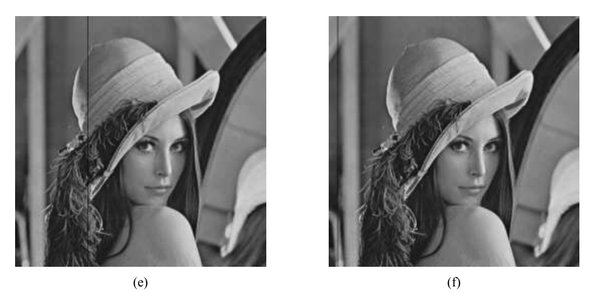
Figure 5. Forgery detection in images using CLIFD. (a) Changes pointed out in multiple pixels in various rows. (b) Manipulation detection in pixels of different rows. (c) changes detected in pixels in multiple columns. (d) Truncation detection. (e) Various bits changes detection in one pixel. (f) Detection of one LSB changes in one pixel.

The proposed technique, i.e., CLIFD, is compared with the previous state-of-the-art techniques using the benchmark image Free-Form Copy-Move Forgery (FFCMF) dataset (Gürbüz et al., 2019). The images in the dataset are manipulated in various manners. The proposed technique and the techniques presented in Lyu et al. (2002), Shi et al. (2005), Zou et al. (2006), Rad et al. (2015), and Kashyap et al. (2016) are applied to the manipulated images.