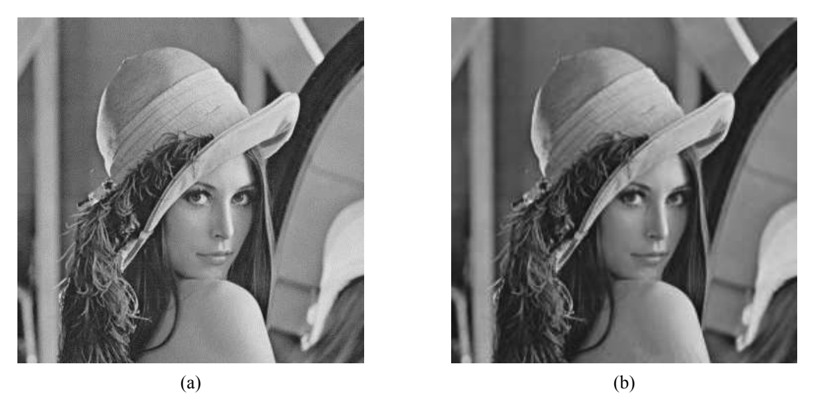
Figure 3. Original and output images using CLIFD. (a) Original image. (b) Image with the hidden signatures.

i.e., Figure 3(b), is compared with the original image, i.e., Figure 3(a), by computing the PSNR. It has been found that the resulting image with hidden digital signature has a PSNR of 74 dB. It is further observed that part of the image that has hidden information, i.e., the selected 32 pixels of each column, has a PSNR of 40 dB. The results show that the proposed technique of hiding signature degrades neither the quality of the resulting image nor the selected pixels.