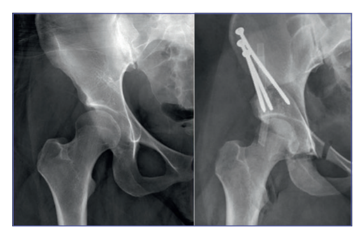
Figure 1. Right hip X-rays, preceding and following Ganz osteotomy.

The image on the left shows the pre-operative investigation, prescribed in order to plan the surgery. The image on the right is the post-operative X-rays; please note there is no pelvic diameter reduction.