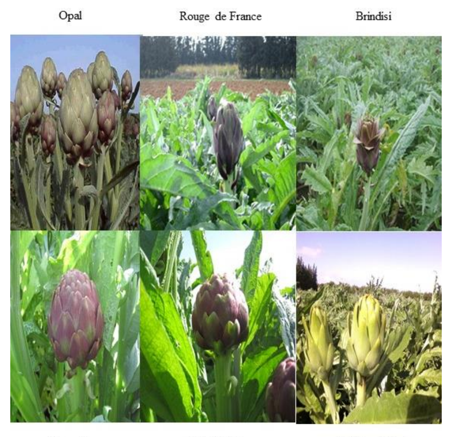
Conserto Romanesco White artichoke Figure 1. globe artichoke cultivars used in the the present trial

The trials were conducted in 2017 at the research and experimentation station of the Potato and Artichoke Technical Center (CTPTA), Mannouba, Tunisia. A total of six artichoke varieties including five purple type (Opal, Conserto, Brindisi, Rouge de France and Romanesco) and one white type variety (white artichoke) were used in this trial (Figure 1).