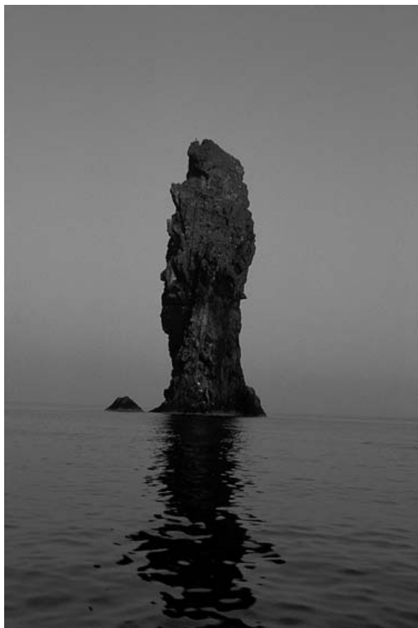
Plate 1 The volcanic rock islet La Canna, 1.5 km west of Filicudi Island (Photo by Massimo Capula).

the number of specimens captured on each island over the ten-year research period are reported in Table 1 and Fig. 2, respectively.