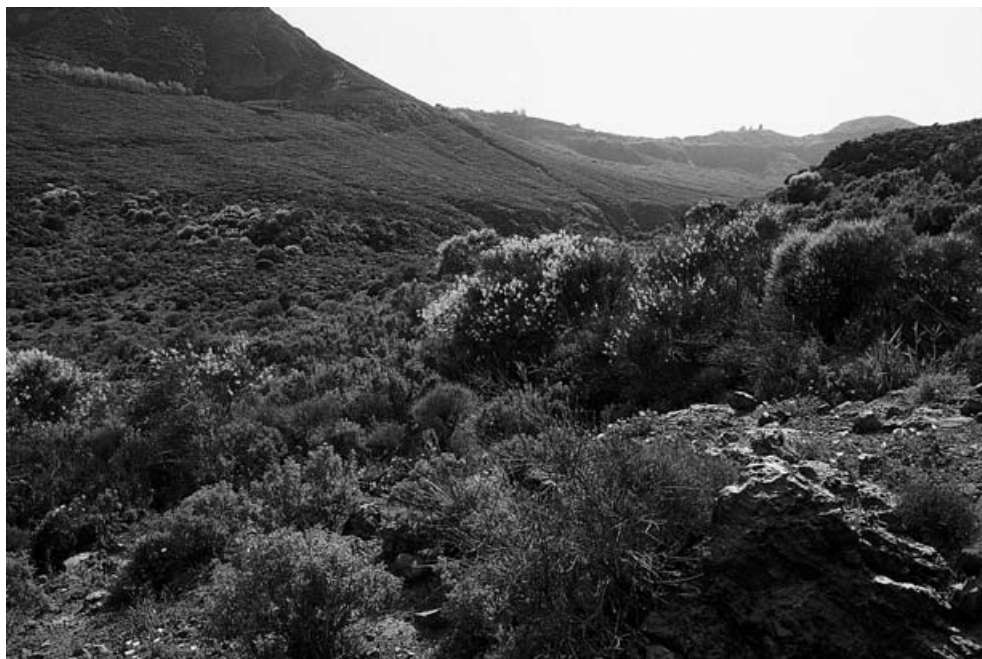
Plate 2 Typical habitat (maquis-type vegetation) of P. raffonei in the Gran Cratere area of Vulcano Island.

P. raffonei is still not regulated by law, and control on remote sites (e.g. the tiny islands) remains difficult.