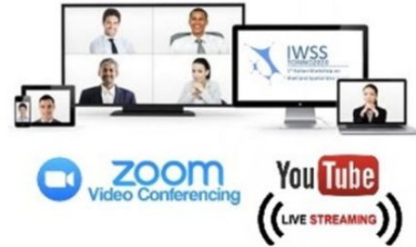
Figure 1: Header of the IWSS 2020 Homepage (top). Pavillon-C Exhibition Center in Turin by Riccardo Morandi, 1950 (bottom left); the Sabaudian city in northern Italy was the chosen conference site before COVID-19 outbreak. On-line platforms for IWSS2020 direct broadcast in June 2020 (bottom right)

structures. These may also include tension elements and membranes, framed and lattice structures, grid-shells and active-bending structures, shell roofs, tensegrity structures, pneumatic and inflatable structures, active and deployable structures, concrete, metal, masonry, timber and bio-inspired structures.