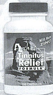
ARCHES TINNITUS RELIEF FORMULA®