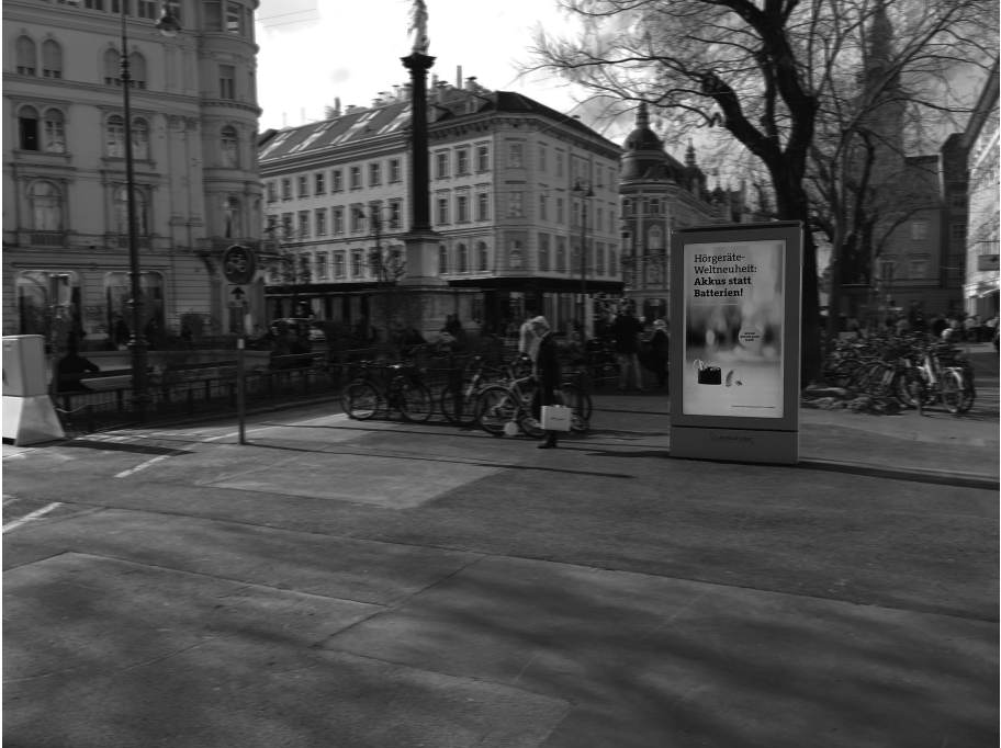
Fig. 1. Graz city information terminals

In summary, the senseable city concept can be resumed as the “ Technology recedes into the background, and interaction is brought to the fore. Buildings and public open spaces can be simple-rather than voluptuous and shocking – but even more integrally vibrant and living ” (Ratti and Claudel 2016: 62–73).