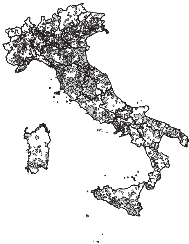
Fig. 2. The distribution of refugee centres across Italy (November 2016). Note. The figure displays the geographical distribution of refugee centres in Italy (as of November 2016). The dots represent a municipality ( j ) hosting at least one refugee centre.

The coefficients on Distance ( D_{ij} ) must sum to zero across the four columns since the dependent variables are proportions that sum up to one. Thus, the coefficient on Distance for ‘No Turnout’, in column (1), is equal to the sum of the coefficients in columns (2)–(4) but with the opposite sign. We report the coefficient of ‘No Turnout’ in the first column since we deem it informative to evaluate how proximity to a refugee centre affects voter turnout and how the casted votes are distributed across the remaining voting outcomes, namely ‘Yes’, ‘No’, and ‘Invalid’ votes.